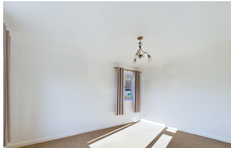
19 St Michaels Close, Crich, Matlock, Derbyshire DE4 5DN £270,000 - Freehold