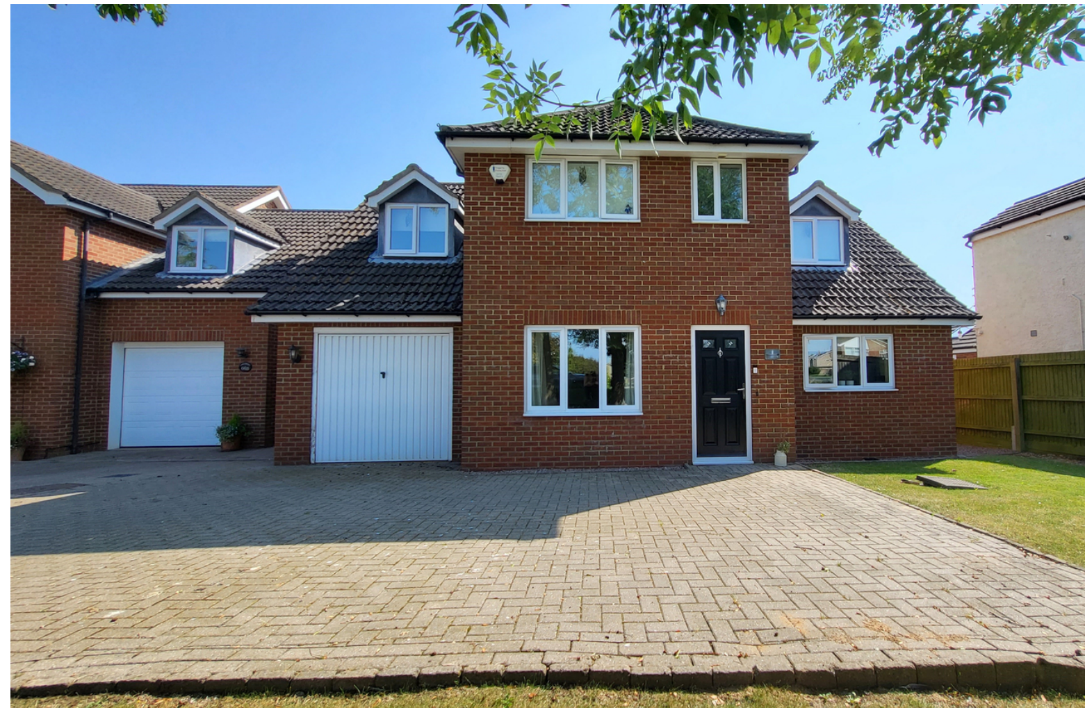
66a North Street, Stilton, Peterborough PE7 3RP