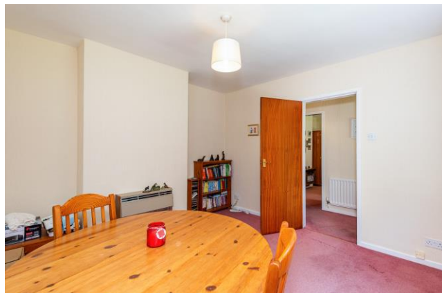
DINING ROOM/BEDROOM 3

BEDROOM 1 (12'3 max x 12' max) Wall mounted gas fire and double glazed window to the front with radiator below.