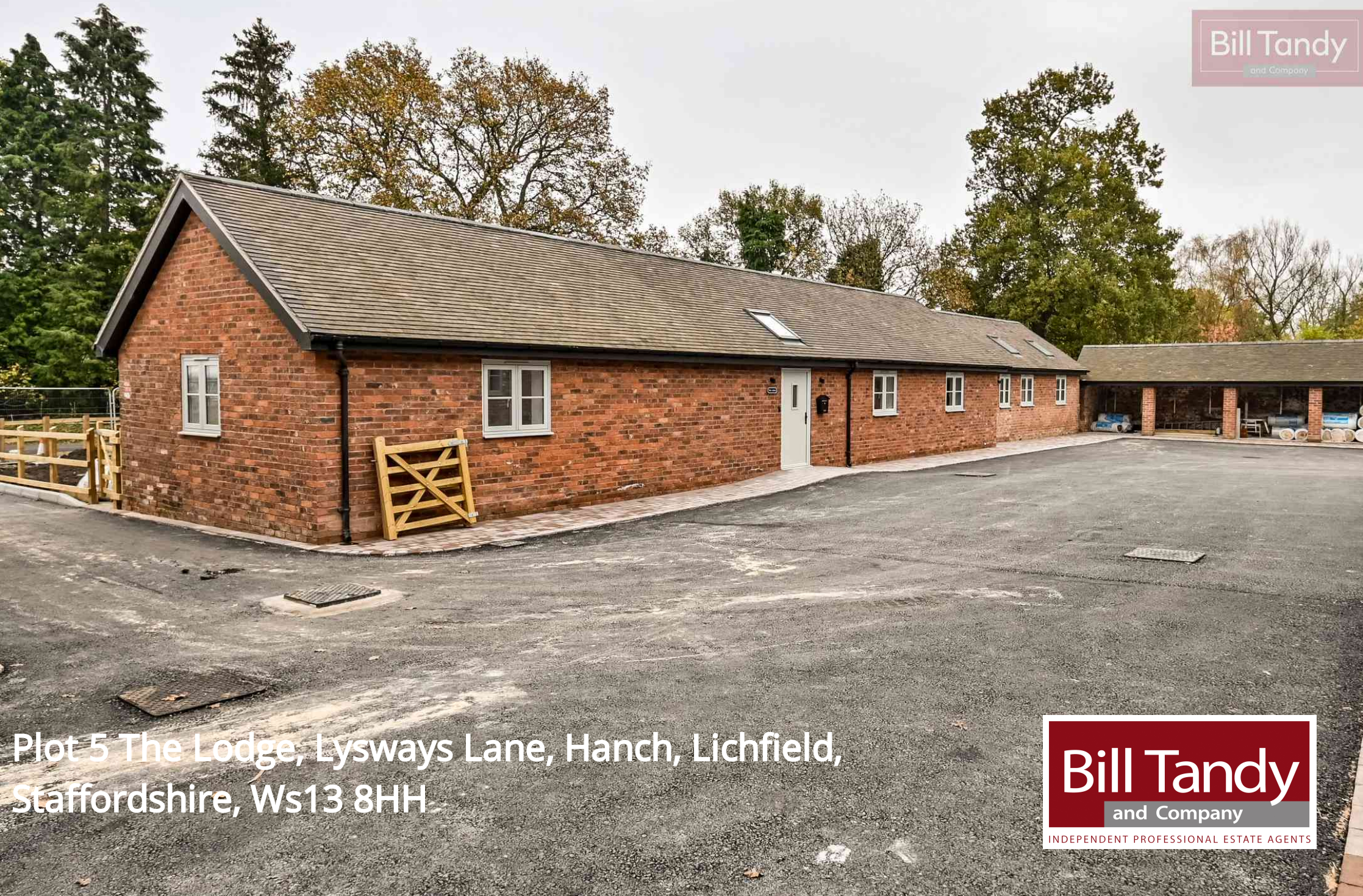
Plot 5 The Lodge, Lysways Lane, Hanch, Lichfield, Staffordshire, Ws13 8HH