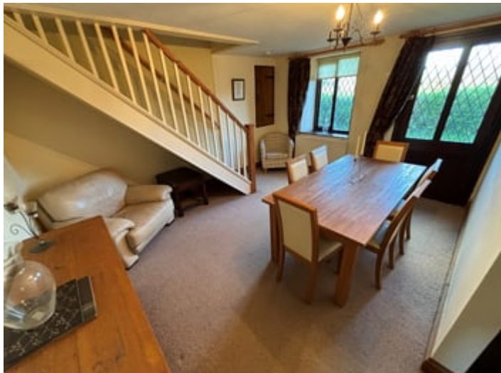
DINING ROOM (SECOND IMAGE)

14' 0" x 11' 7" (4.27m x 3.53m). With leaded front entrance door, staircase to the first floor accommodation, radiator.