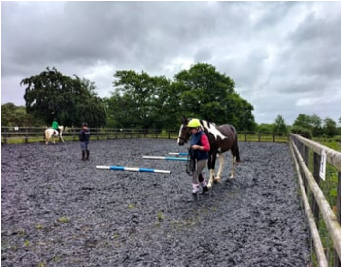
MENAGE (THIRD IMAGE)