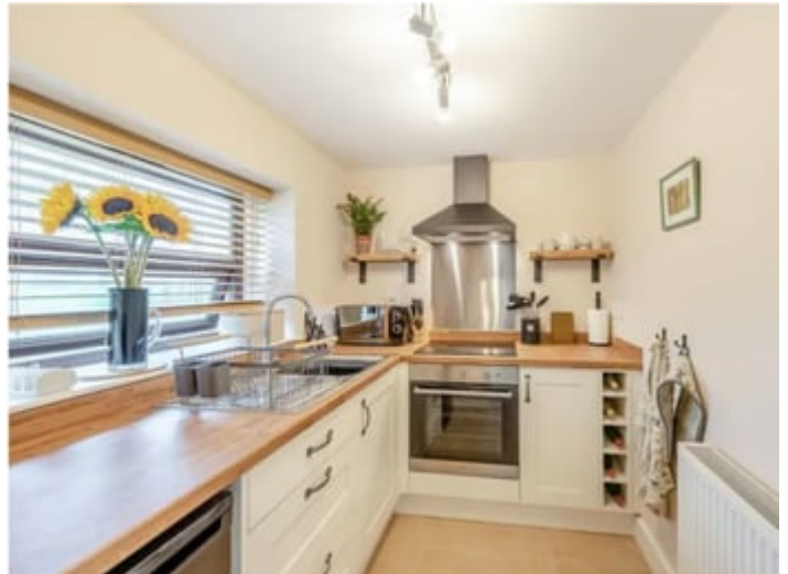
COTTAGE KITCHEN (SECOND IMAGE)

8' 0" x 6' 0" (2.44m x 1.83m). A fully refurbished modern Shaker style fitted kitchen with fitted units, electric fan oven, 4 ring ceramic hob with extractor hood over, single sink and drainer unit.