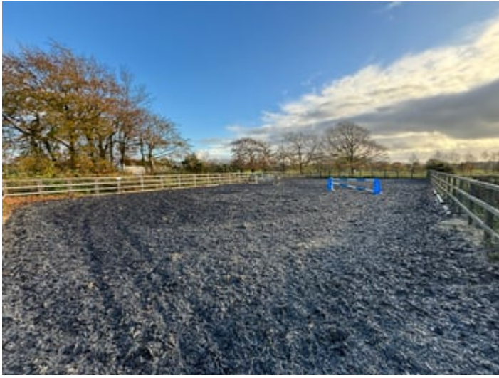
MENAGE (SECOND IMAGE)

20m x 40m (65' 7" x 131' 3"). A fantastic outdoor riding school being enclosed with sand and rubber surface. Suiting all Equestrian activities.