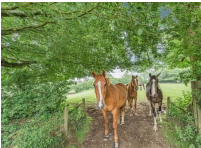
THE LAND (SIXTH IMAGE)