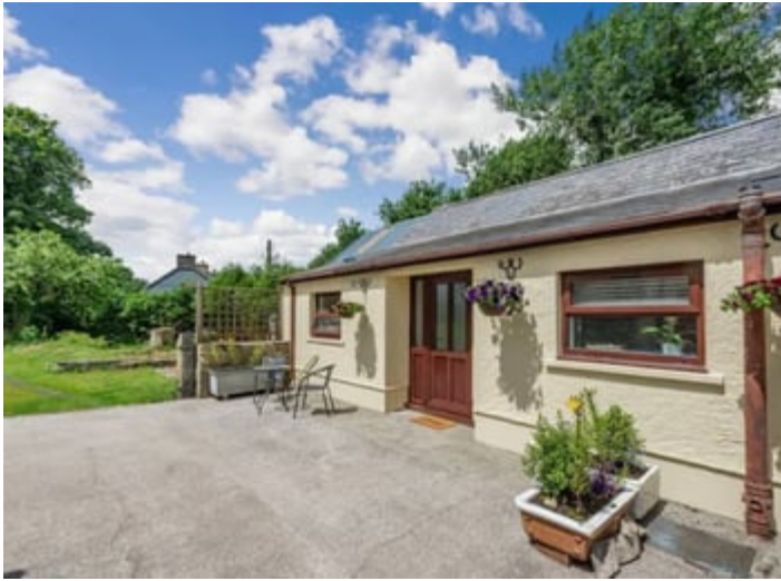
THE COTTAGE - FRONT ELEVATION

The cottage adjoins the main farmhouse and has recently been fully refurbished to offer a modern and contemporary holiday accommodation having the electrics and plumbing upgraded, a new kitchen, bathroom, flooring and heating throughout and insulated. It has enjoyed 2 successful seasons (85% occupancy Feb-Oct) with excellent guest reviews & received Customer Choice Award 2023.