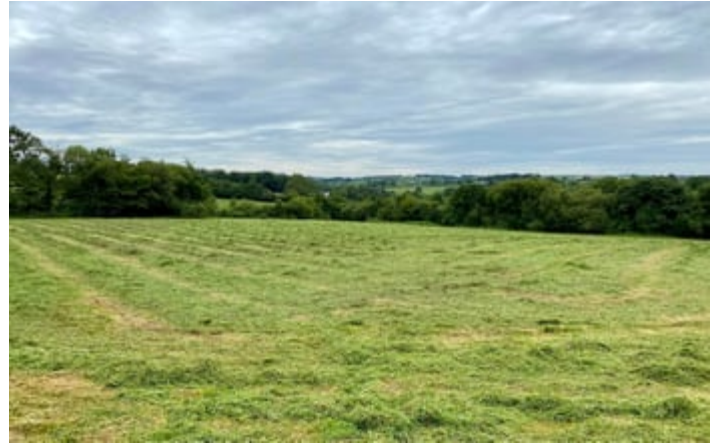
THE LAND (SECOND IMAGE)

In all the land extends to approximately 22 ACRES or thereabouts. It is split into level well managed and useful sized pasture paddocks. The land is mostly level in nature with ample natural hedge line shelter with the hedges being double fenced and all paddocks are gated.