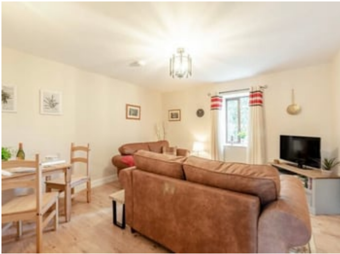
COTTAGE LIVING ROOM (SECOND IMAGE)

13' 6" x 13' 6" (4.11m x 4.11m). With radiator.