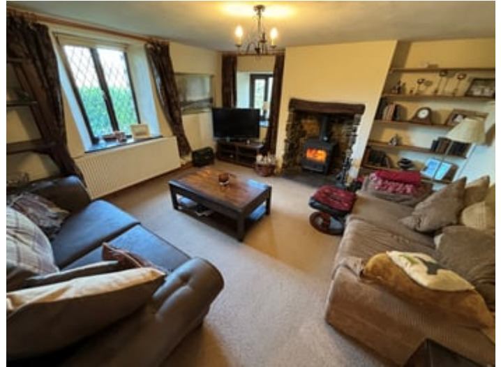
LIVING ROOM (SECOND IMAGE)

14' 0" x 13' 10" (4.27m x 4.22m). With a feature stone fireplace with Oak beam over incorporating a 'Clear View' wood burning stove, ledged window to the front and side, radiator, archway leading to Dining Room.