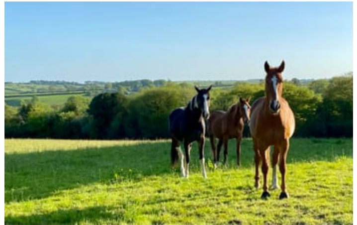
THE LAND (THIRD IMAGE)