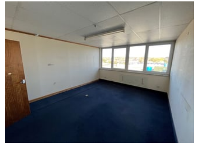
£1300 per month.