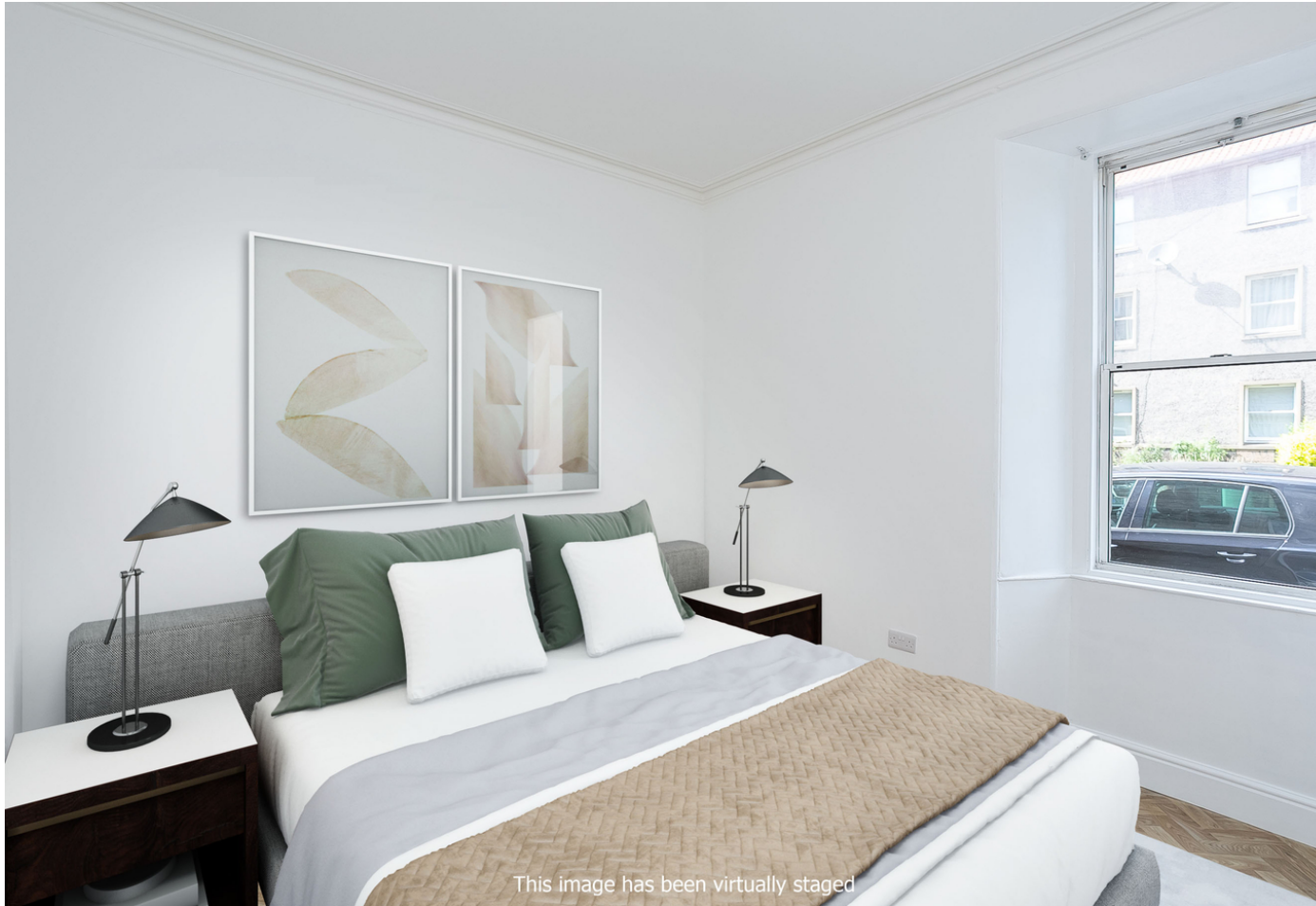
This image has been virtually staged