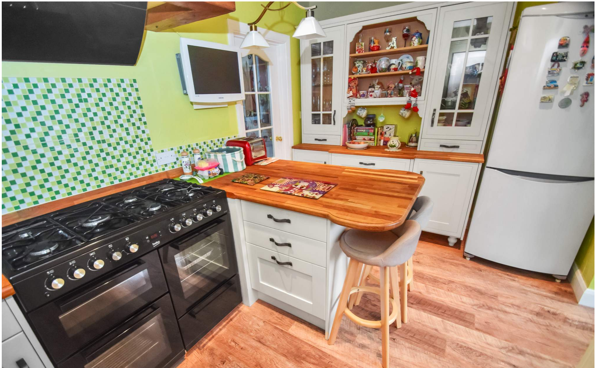
BERENGRIVE LANE, RAINHAM, GILLINGHAM, KENT, ME8 7LS