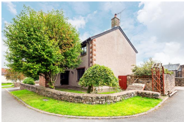
FRONT OF THE PROPERTY

GARAGE (19'7 x 10') Electric roller door, power and light, wood framed double glazed window to the side, built-in shelved storage cupboards, loft access into the pitched roof and UPVC double glazed door to the garden.