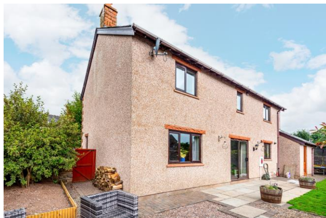
REAR OF THE PROPERTY

LOCATION Sandford is a small desirable hamlet with its own popular pub The Sandford Arms. A short drive away is the village of Warcop with primary school and play park. This is a wonderful semi-rural location that provides easy access to Appleby, Penrith and the Lake District and is close to the Westmorland Dales section of the Yorkshire Dales National Park.