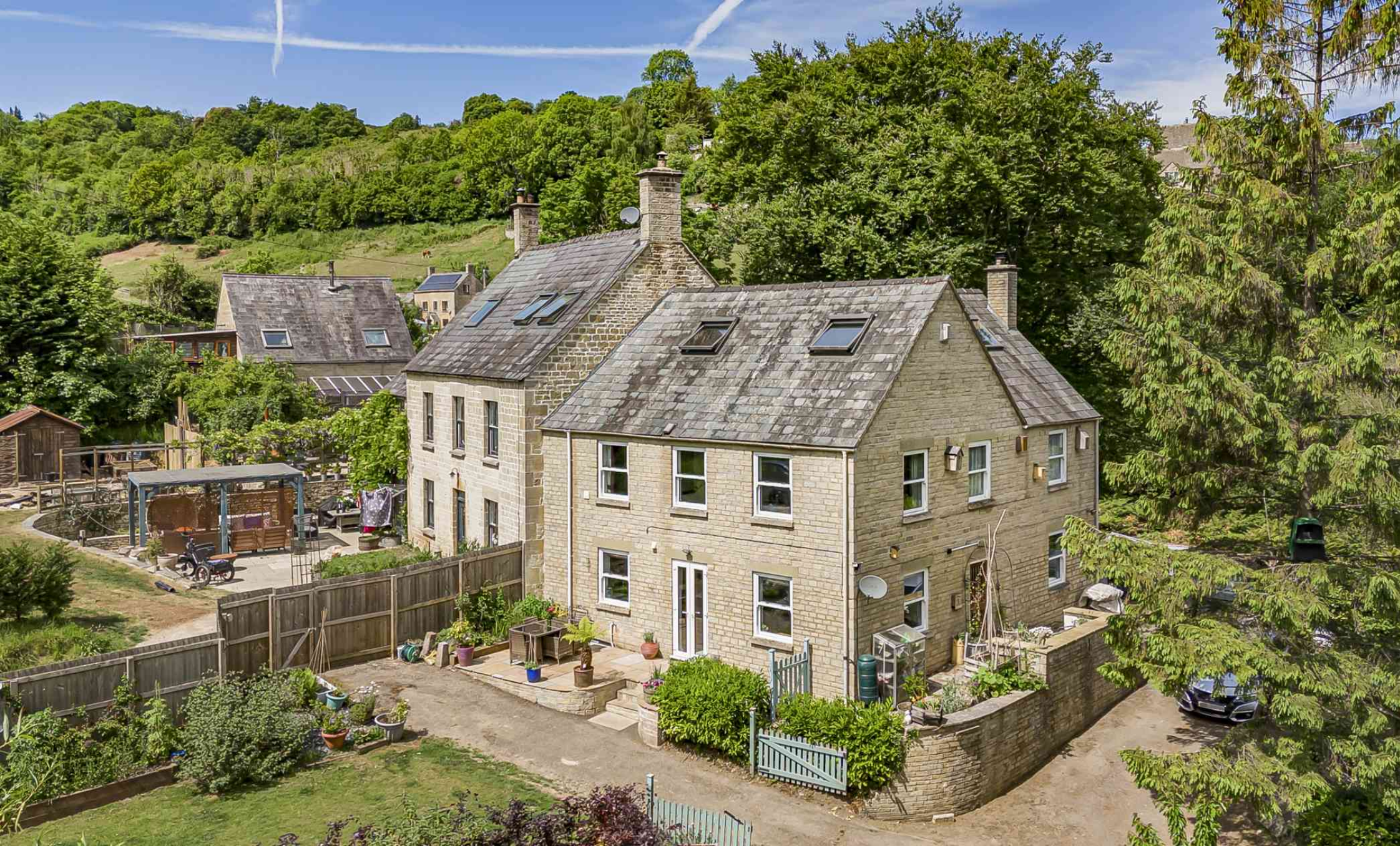
Jubilee Edge, Swells Hill, Brimscombe, Stroud, Gloucestershire, GL5 2SR £675,000