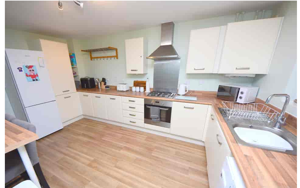
17 Remembrance Close, Middleton Cheney, Banbury, Northamptonshire. OX17 2SL Shared Ownership £126,000 - Leasehold