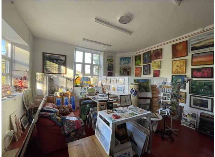
24' 0" x 7' 0" (7.32m x 2.13m) with dual aspect windows to front and side, multiple sockets, heater.