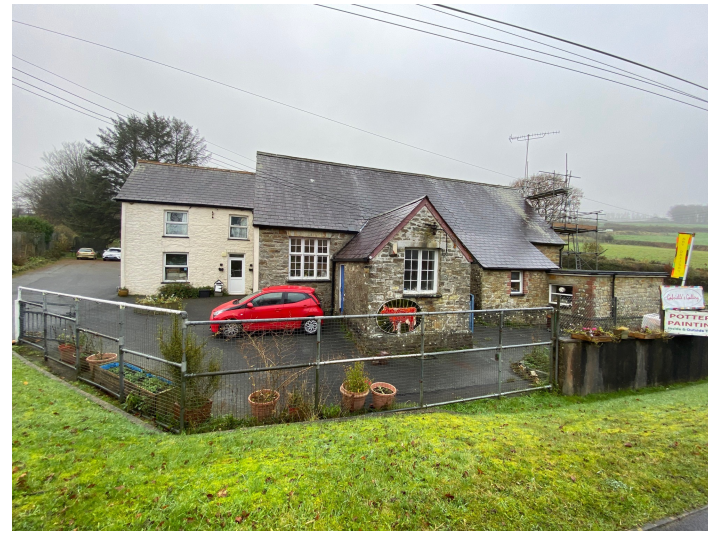
The property has extensive roadside frontage with a walled and secure fenced roadside boundary with double gated vehicular entrance which leads to -