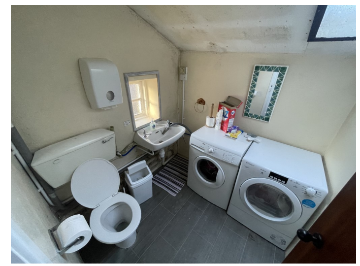
6' 1" x 6' 1" (1.85m x 1.85m) with w.c. single wash hand basin, washing machine connection, velux roof light over.