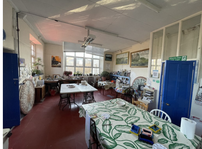
18' 0" x 25' 1" (5.49m x 7.65m) with triple aspect windows to front, rear and side, electric heater, multiple socket, high level ceilings. Access to -