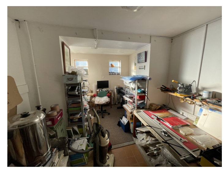
12' 3" x 10' 11" (3.73m x 3.33m) with dual aspect windows to front and side, multiple sockets.