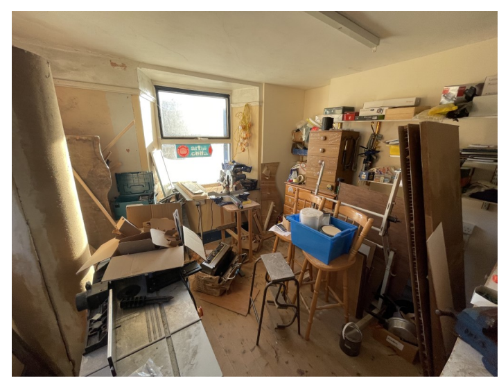
16' 6" x 9' 8" (5.03m x 2.95m) with high level window, part tiled flooring, multiple sockets.