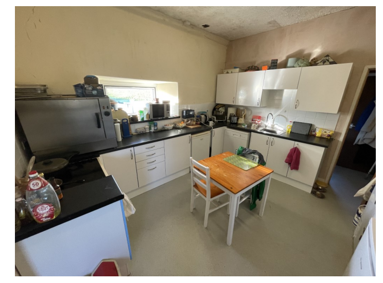
12' 11" x 14' 4" (3.94m x 4.37m) with a range of White base and wall units, sink and drainer with rear window overlooking the yard. Washing machine connection. Space for fridge freezer. Open plan into -