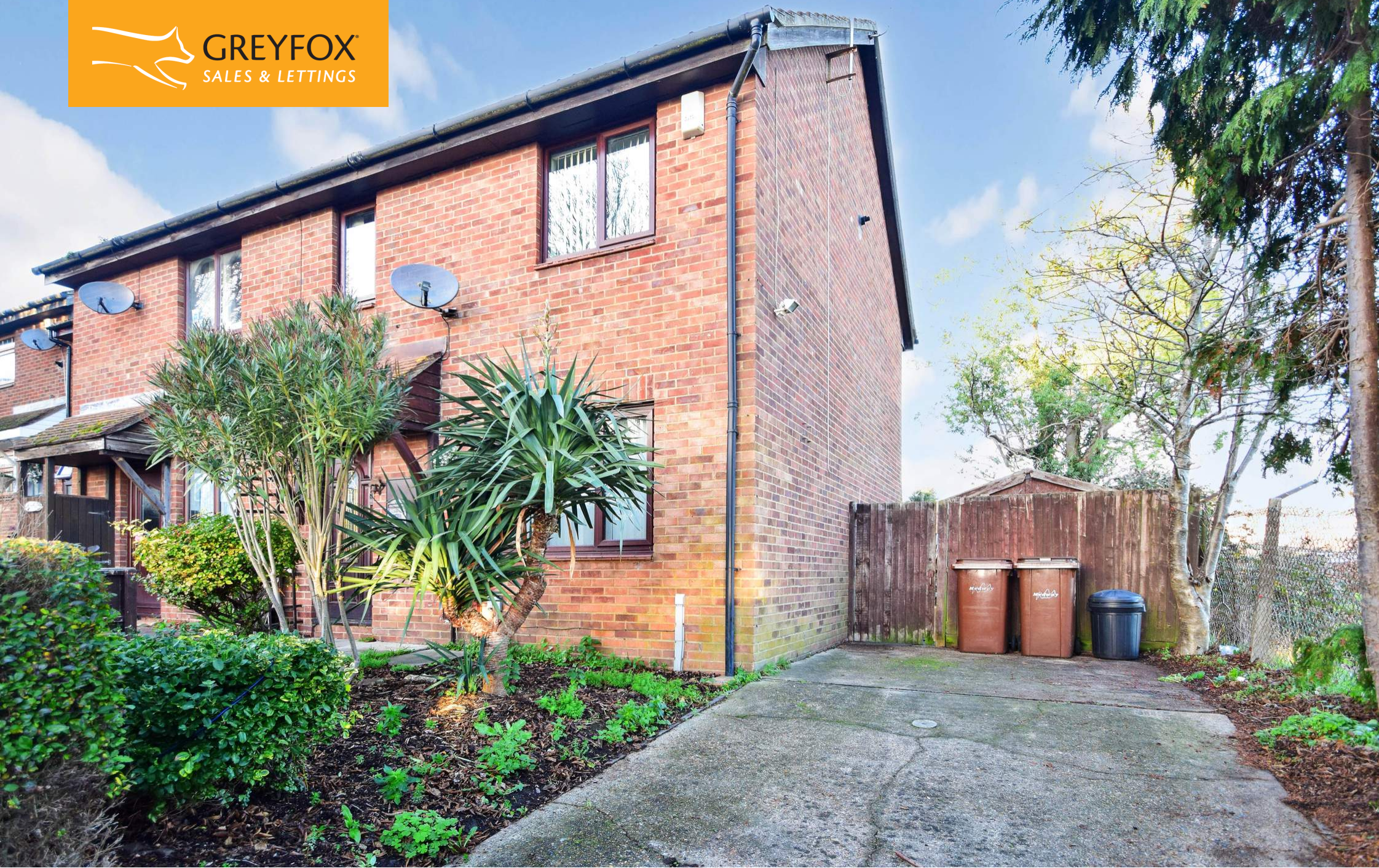
Three Bedroom End of Terrace House Stour Close, Strood, Kent, ME2 3JZ