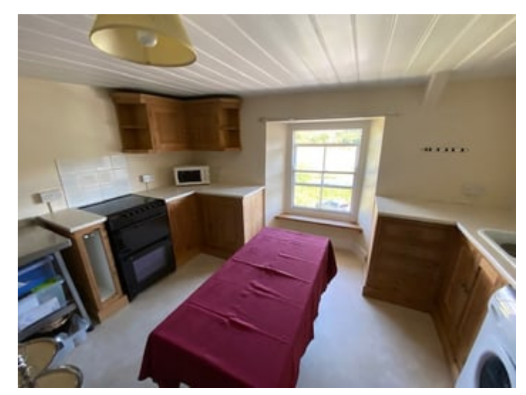
13' 5" x 12' 5" (4.09m x 3.78m) fitted with a range of Oak fronted base and wall cupboard units, stainless steel single drainer sink unit and built in airing cupboard.