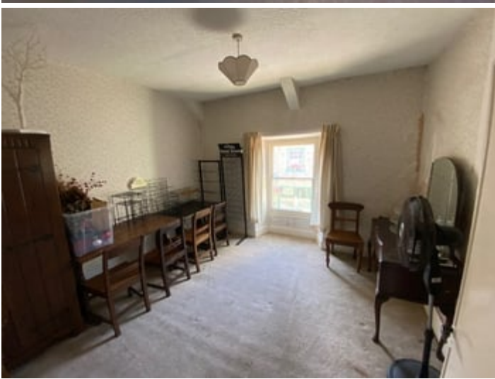
house is living accommodation/flat and is arranged of mezzanine floor levels viz: