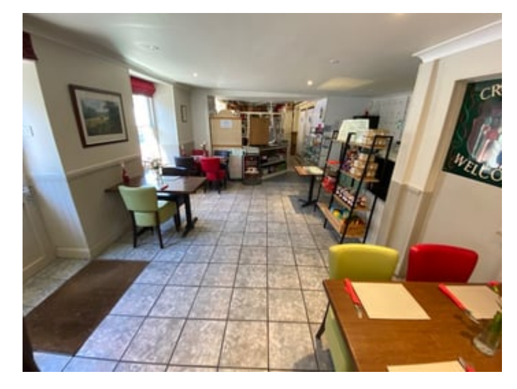
Rear Store Room