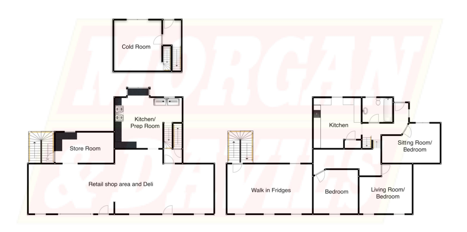
Ty Croeso SA38 9AJ For illustrative purposes only, not to scale