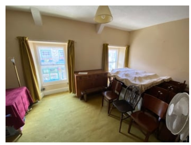
Above the right hand side (Deli area) which was the original