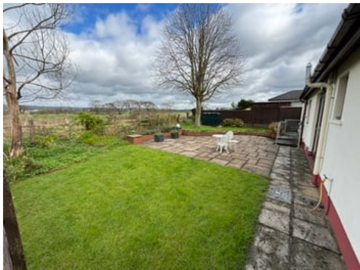
Garden looking out to Paddock

A private garden area being well kept and well designed by the current owner and being laid mostly to level lawn with nicely planted flower borders , large patio and Cherry Blossom tree centrally located within the front garden.