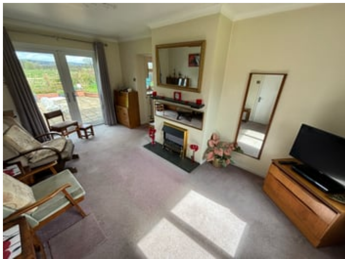
Living Room (Second Image)

16' 9" x 9' 8" (5.11m x 2.95m) with patio doors opening onto rear garden area. Radiator. Telephone and T.V point. Inset electric fire.