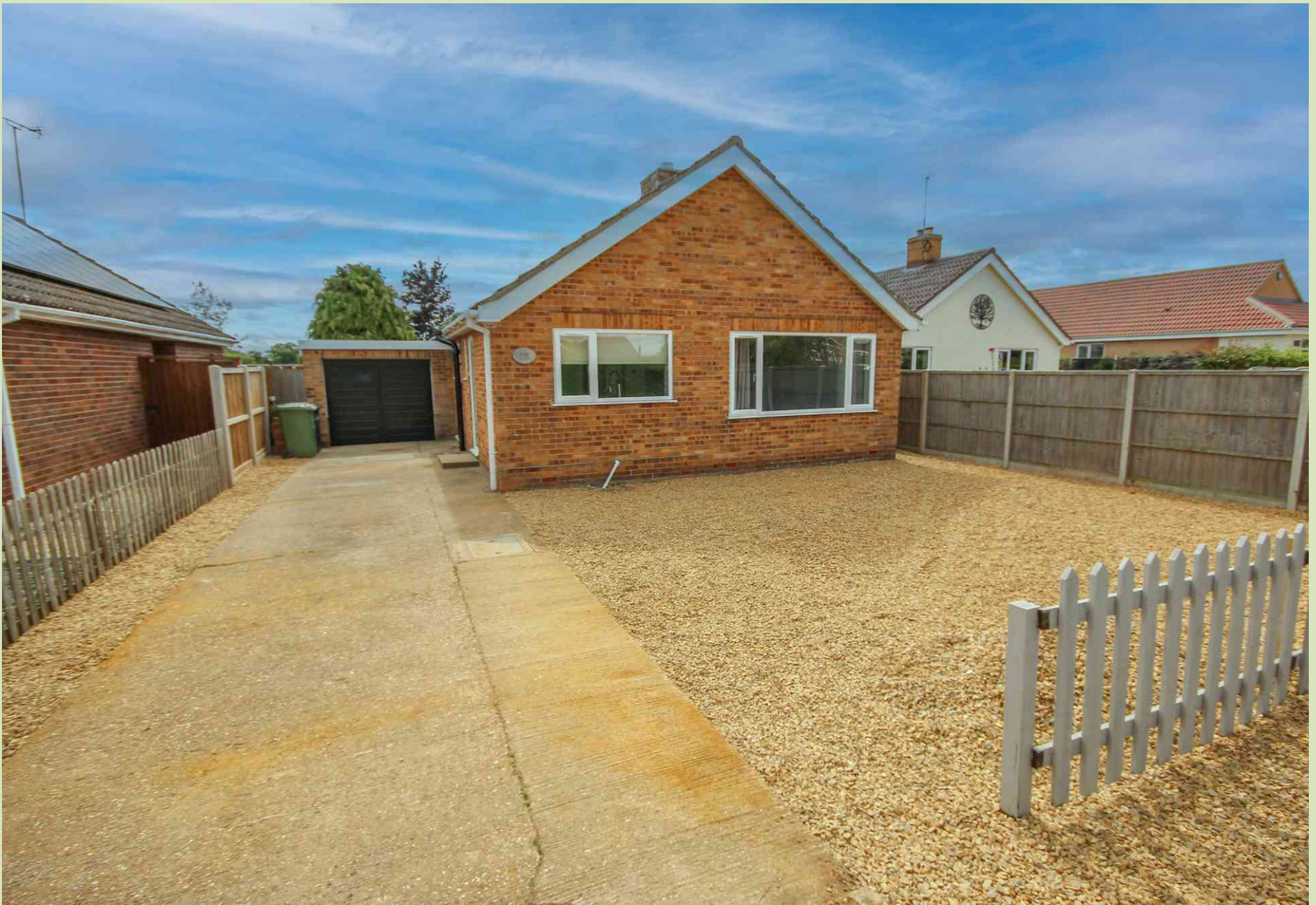
58 Station Road, Clenchwarton Guide Price £244,950