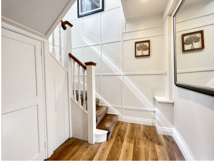
Hallway To Accommodation