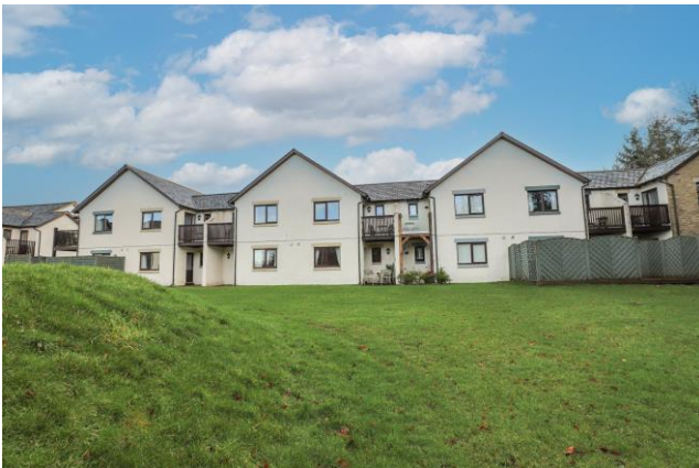
REAR OF THE PROPERTY