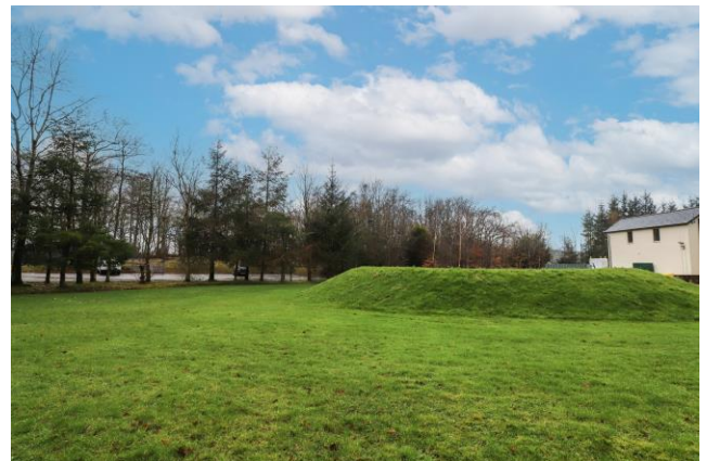
VIEW TO THE REAR

TENURE We are informed the tenure is Leasehold. 999 years from 01/05/2004