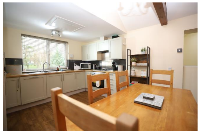
OPEN PLAN LIVING