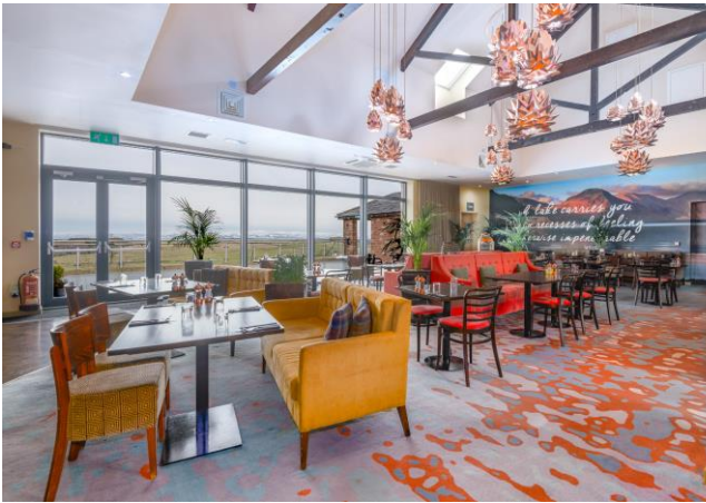
RESTAURANT & BAR