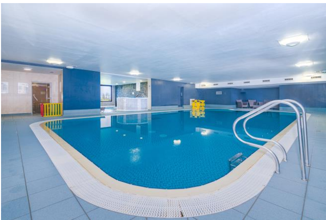
POOL & JACUZZI