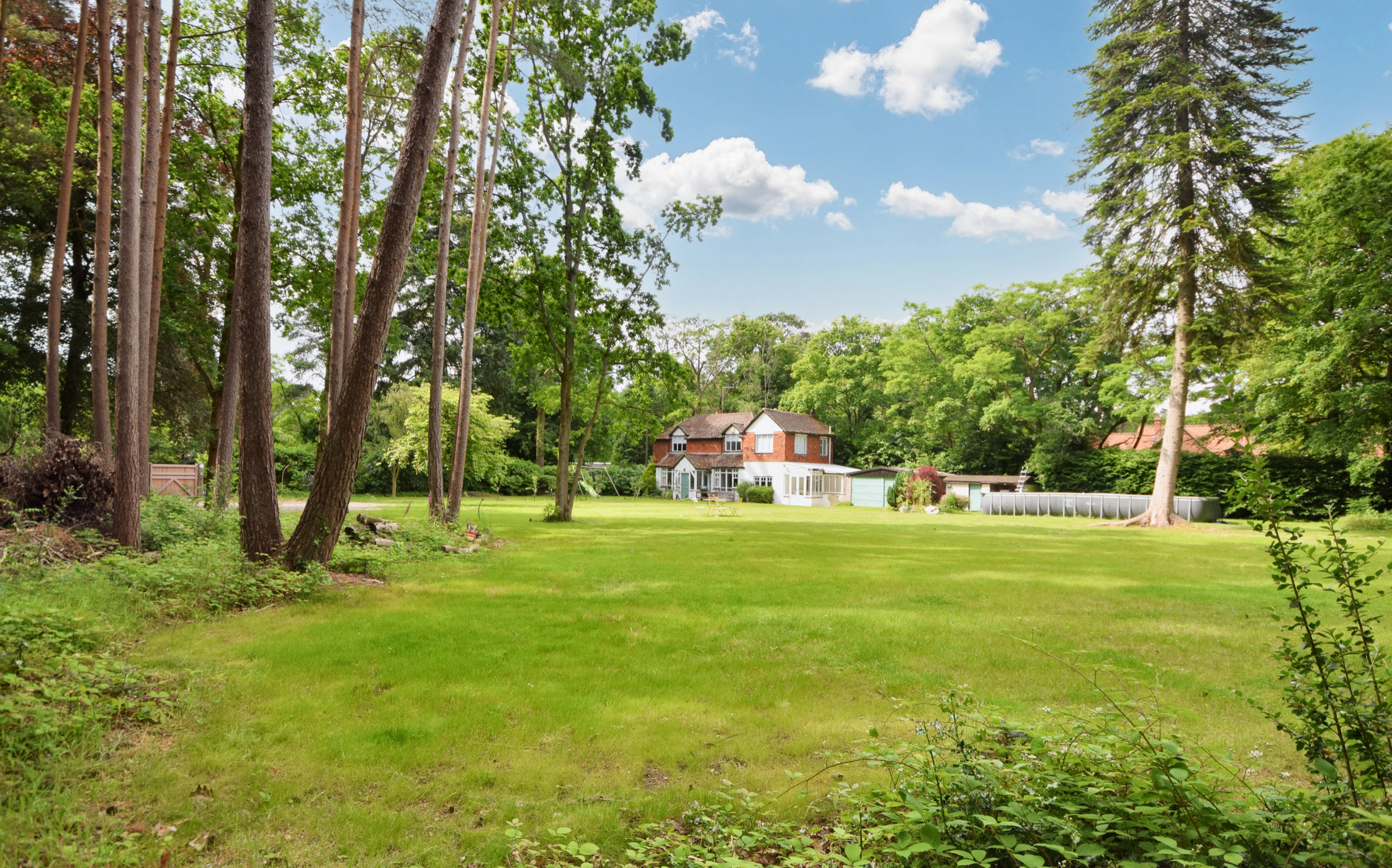
Pinewood Lodge, Eglinton Road, Rushmoor, Farnham, Surrey. GU10 2HA. £3,750 pcm