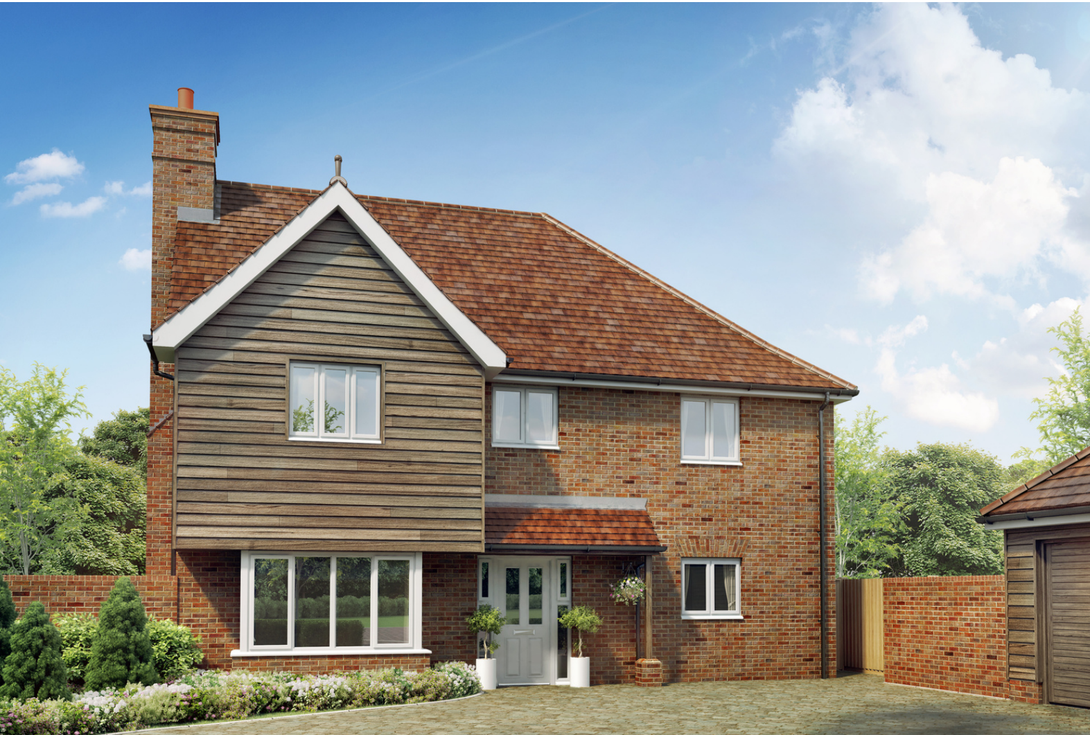
The Fern - Plot 15, Radstone Gate, Thorn Lane, Stelling Minnis, Canterbury, Kent. CT4 6DA