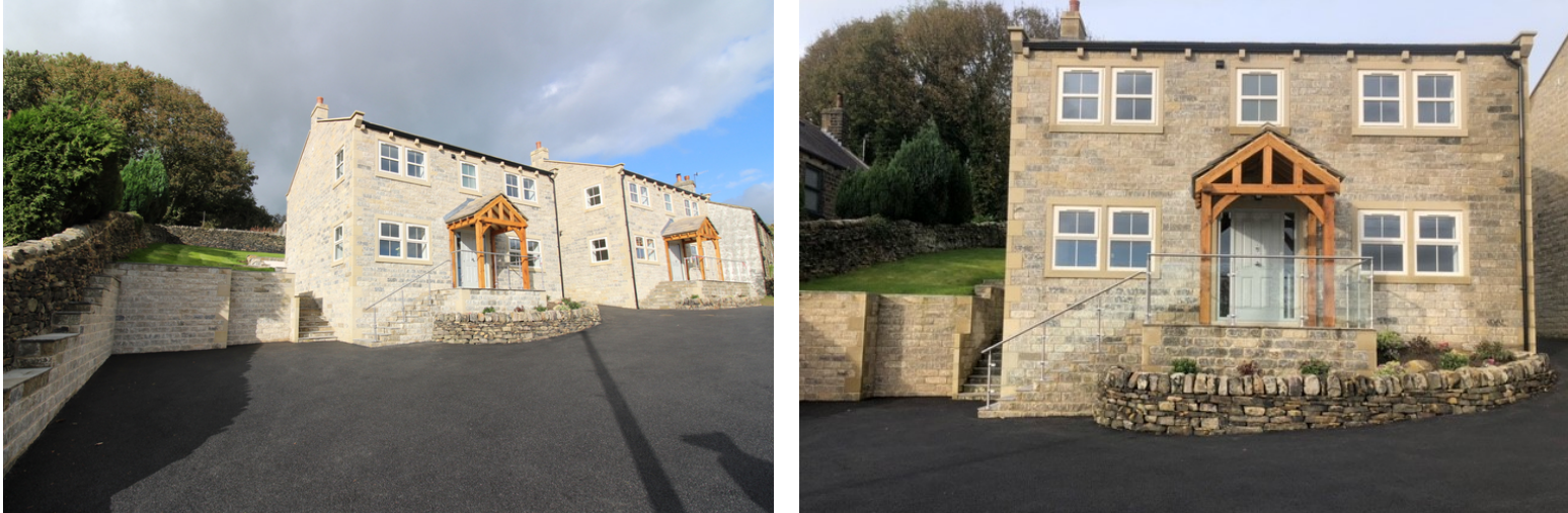
186 The Croft, Sykes Head, Oakworth, Keighley, West Yorkshire, BD22 7ES