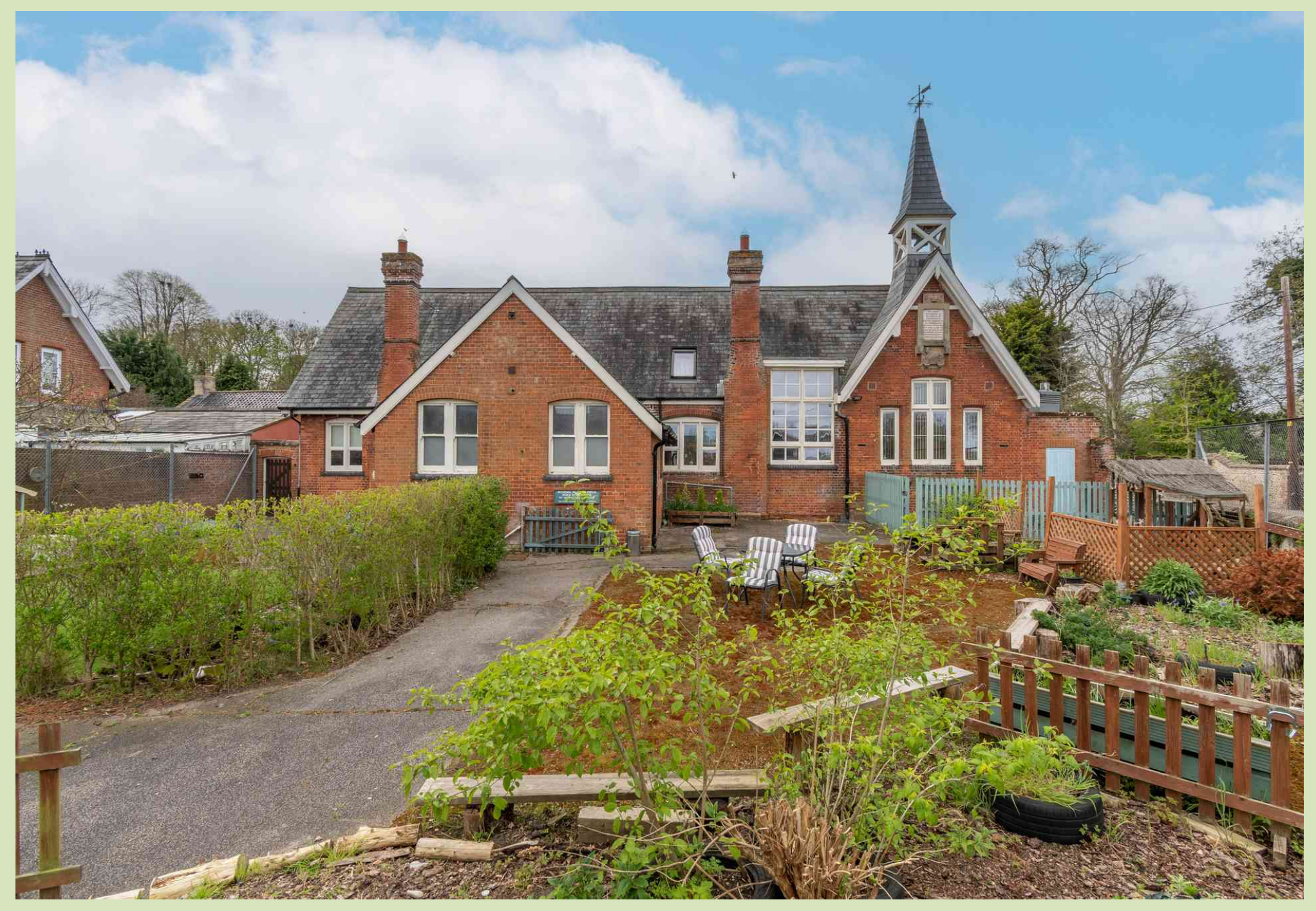
The Old School, Great Ryburgh Guide Price £599,950