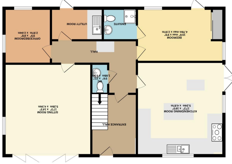
GROUND FLOOR 1090 sq.ft. (101.3 sq.m.) approx.