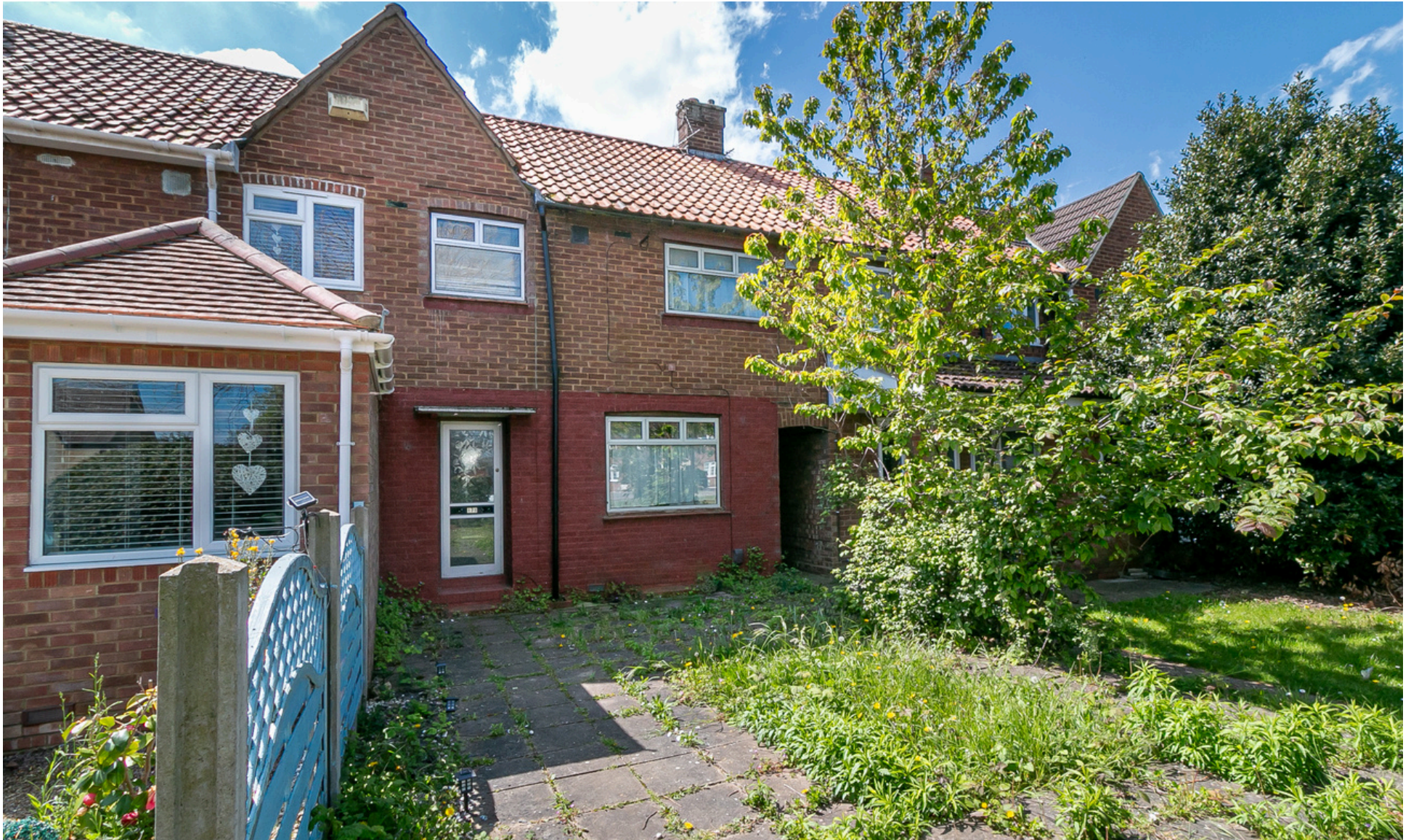
Mullway, Letchworth, Hertfordshire