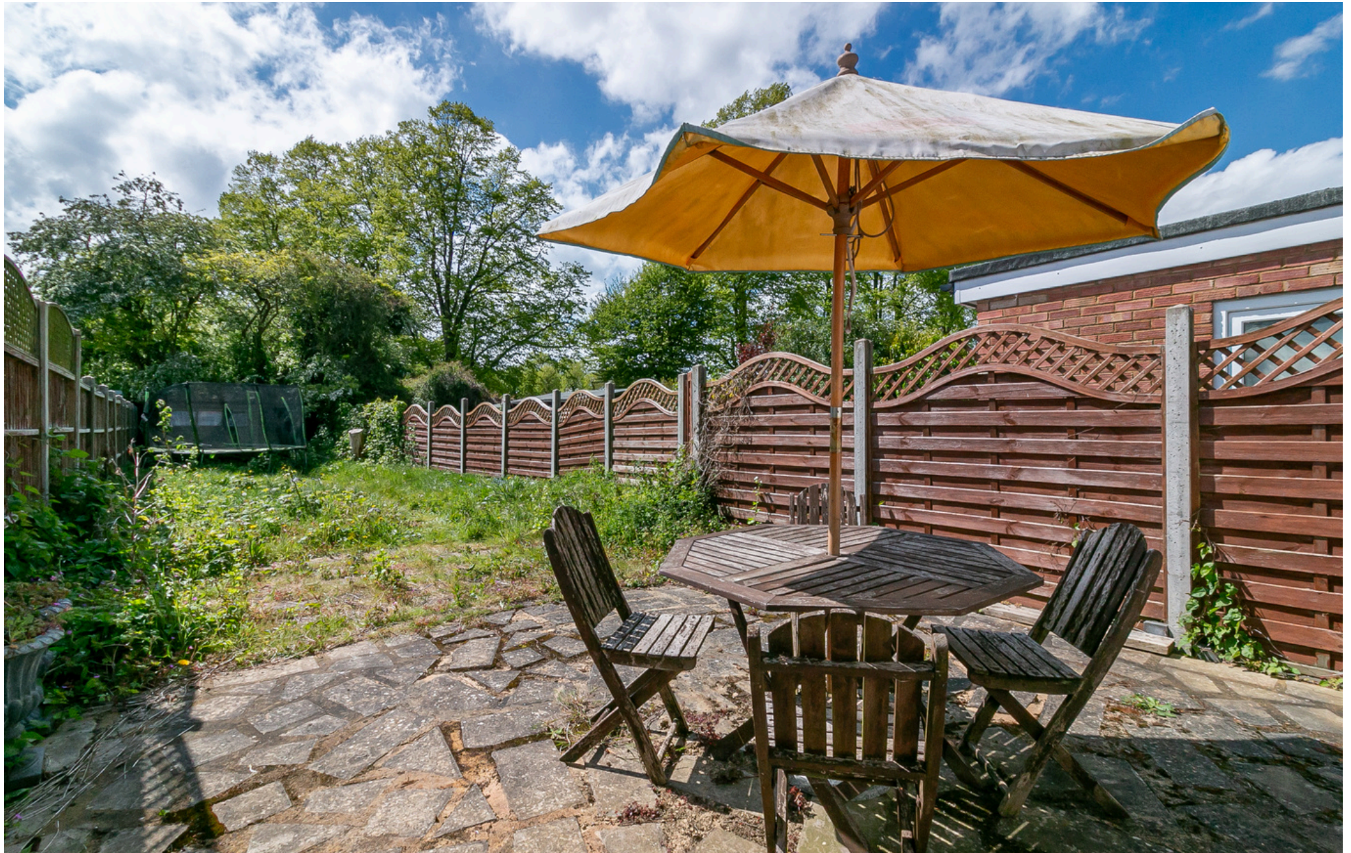
Mullway, Letchworth, Hertfordshire