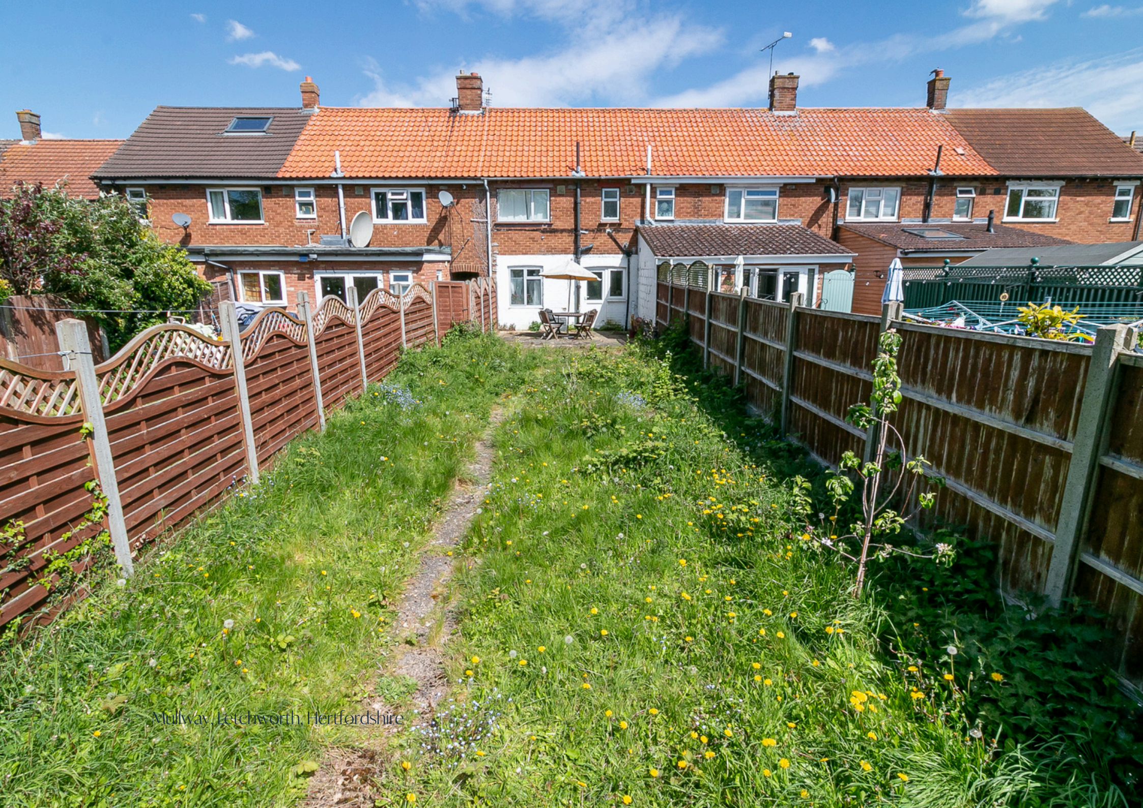
Mullway, Letchworth, Hertfordshire