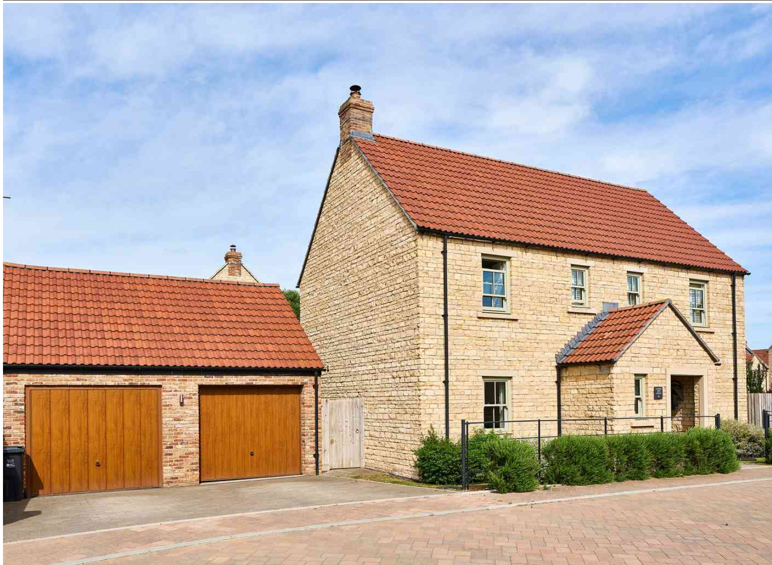
16 St Lawrence Lane, Rode