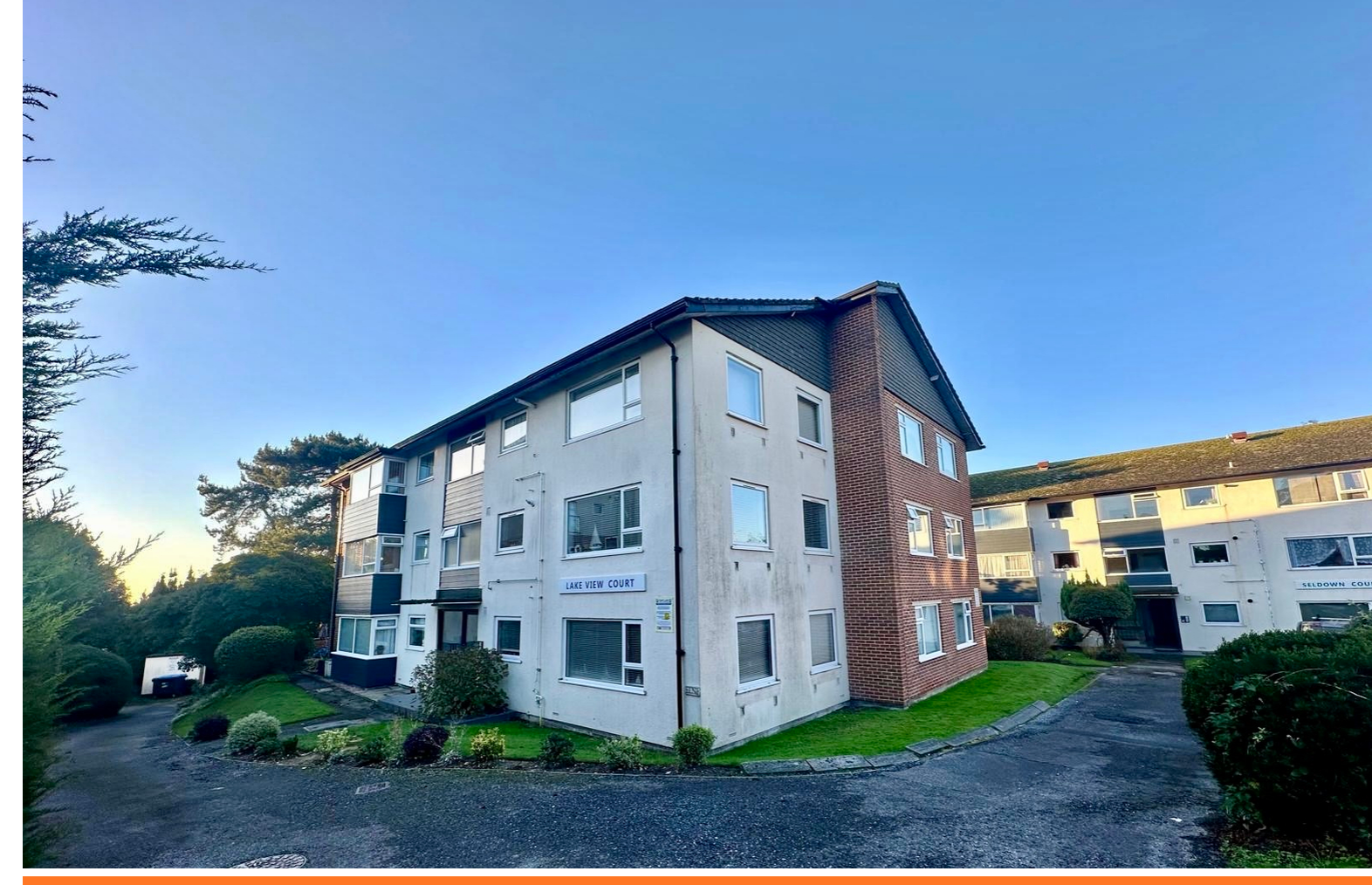
Flat 9, 39 Lake View Court, Mount Pleasant Road, Poole, Dorset, BH15 1TX Guide Price £240,000

** STUNNING VIEWS OVER POOLE PARK LAKE ** Link Homes Estate Agents are delighted to present for sale this two bedroom, second floor apartment situated in the BH15 postcode and just moments from the popular Poole Park. Benefitting from an array of standout features including a separate modern kitchen with integrated appliances, a good sized living room with views overlooking Poole Park, bay windows to bedroom one, a bathroom with a separate W/C, a single garage with an up and over door and a communal roof terrace. This is the perfect first time buy in a truly great location!