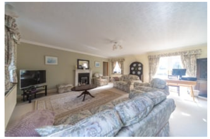
20' 4" \times 19' 7" (6.20m \times 5.97m) With dual aspect windows to front and rear, patio doors to rear garden, feature electric fire and surround, corner TV point, 2 \times radiator, multiple sockets.