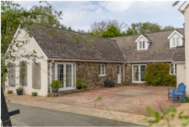
Corner Summer House