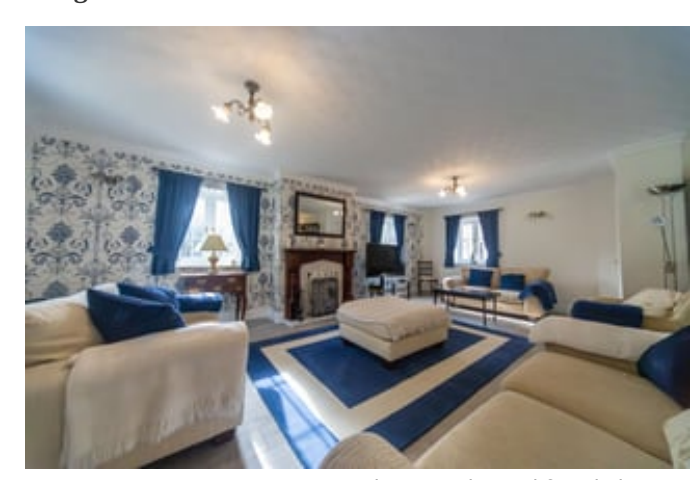
26' 8" x 22' 8" (8.13m x 6.91m) a large L shaped family living room with feature open fireplace and marble surround, wood effect flooring, 2 x radiator, triple aspect windows to front and side garden and forecourt. Side patio door to garden. Connecting door into -