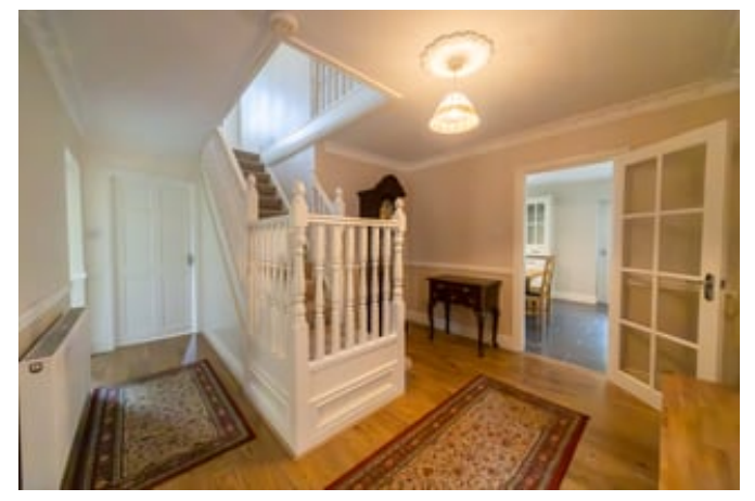
29' 7" \times 11' 6" (9.02m \times 3.51m) with Oak effect flooring, doors to all ground floor rooms, radiator. Access into -