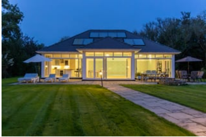
entertain, enjoying an outlook over Ty Cwm.

The building has been designed to maximise the use of