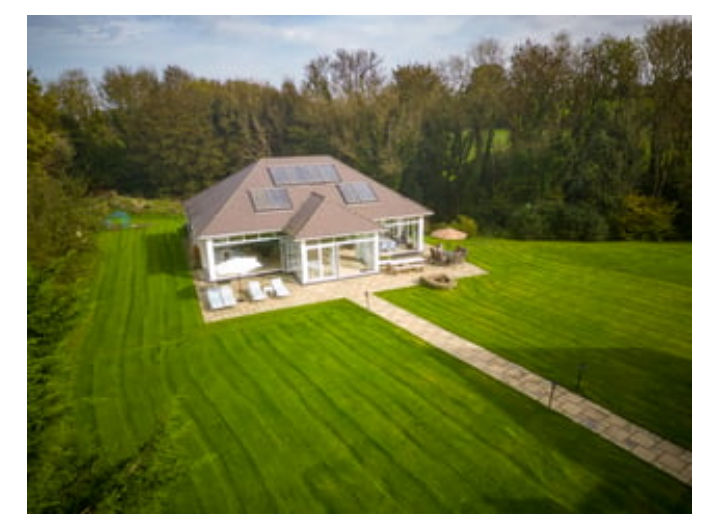
36' 5" \times 40' 1" (11.10m \times 12.22m) being one of the main features of the property offering a custom made building with focus and attention given to relaxation but also the ability to