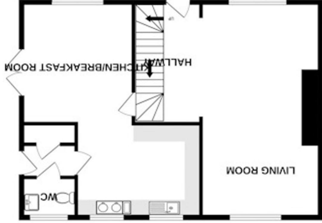
GROUND FLOOR 857 sq.ft. (79.6 sq.m.) approx.