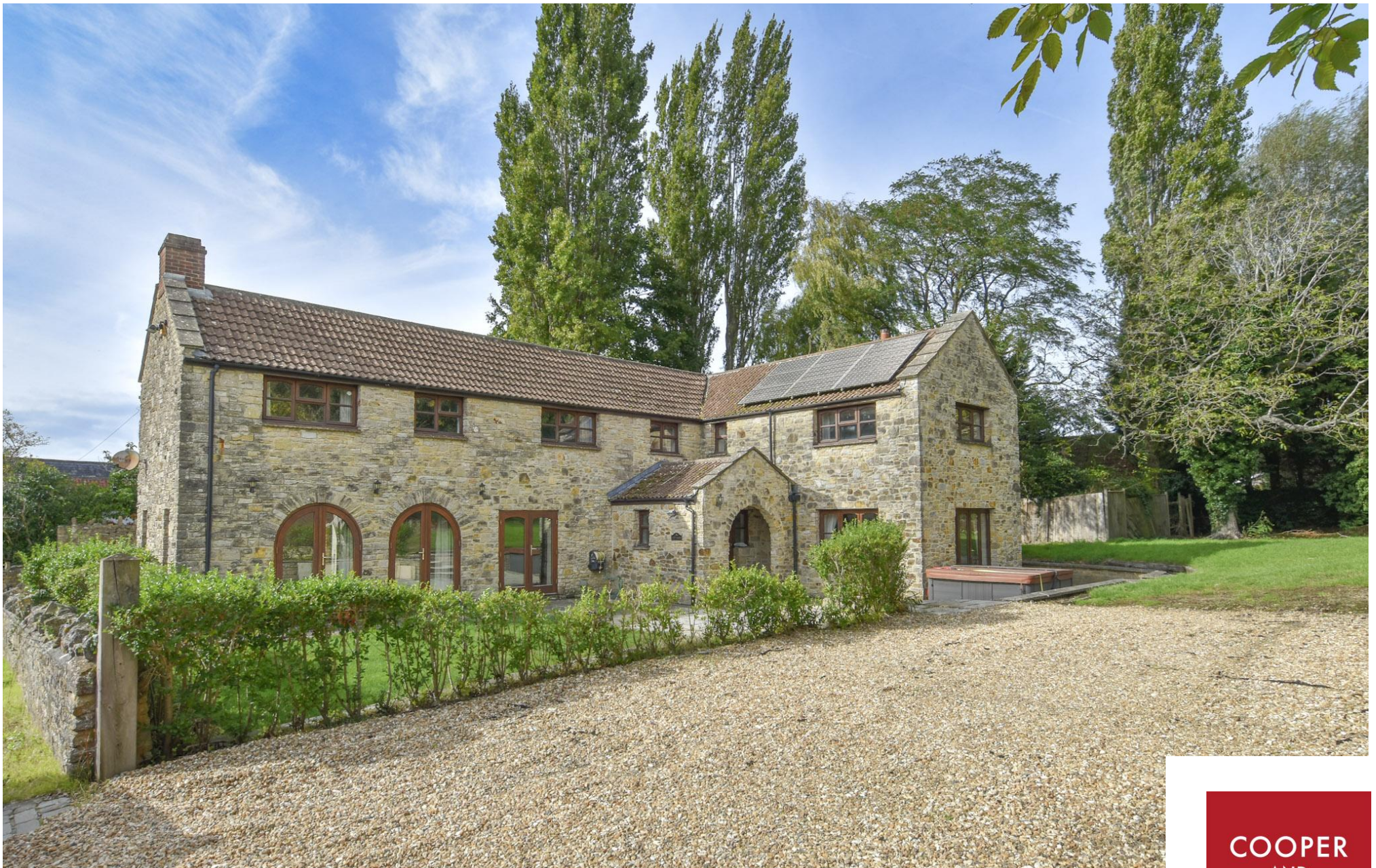
The Barn, Shortlands Lane, Wedmore BS28 4BX

Auction Guide Price £900,000 - £1,000,000 Freehold