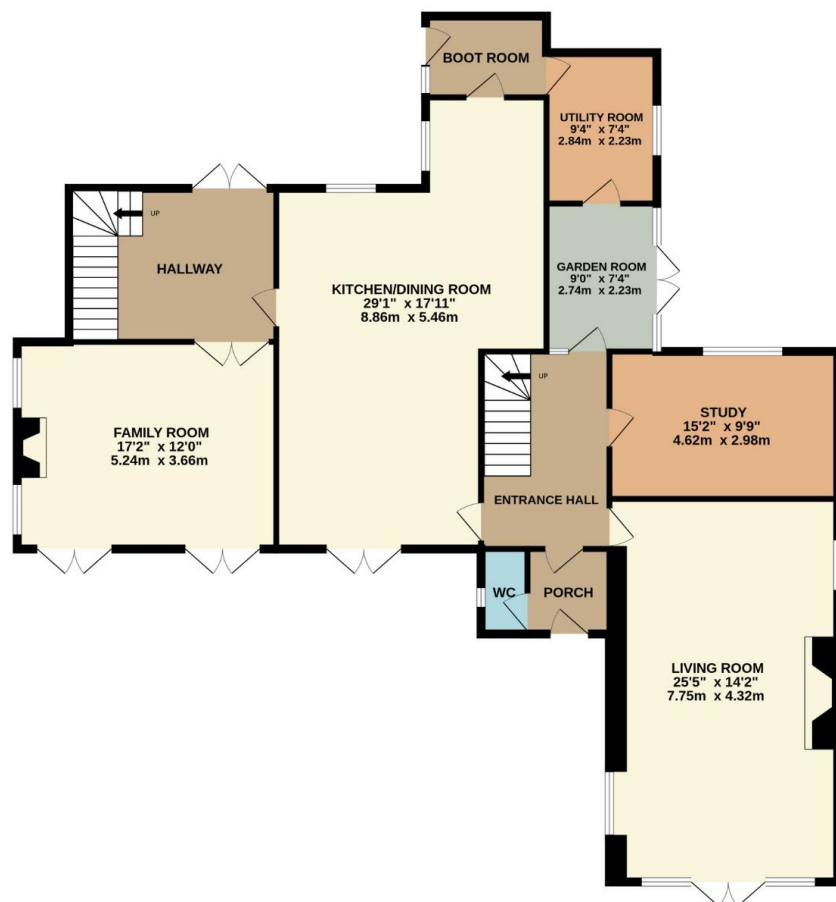
GROUND FLOOR 1643 sq.ft. (152.7 sq.m.) approx.