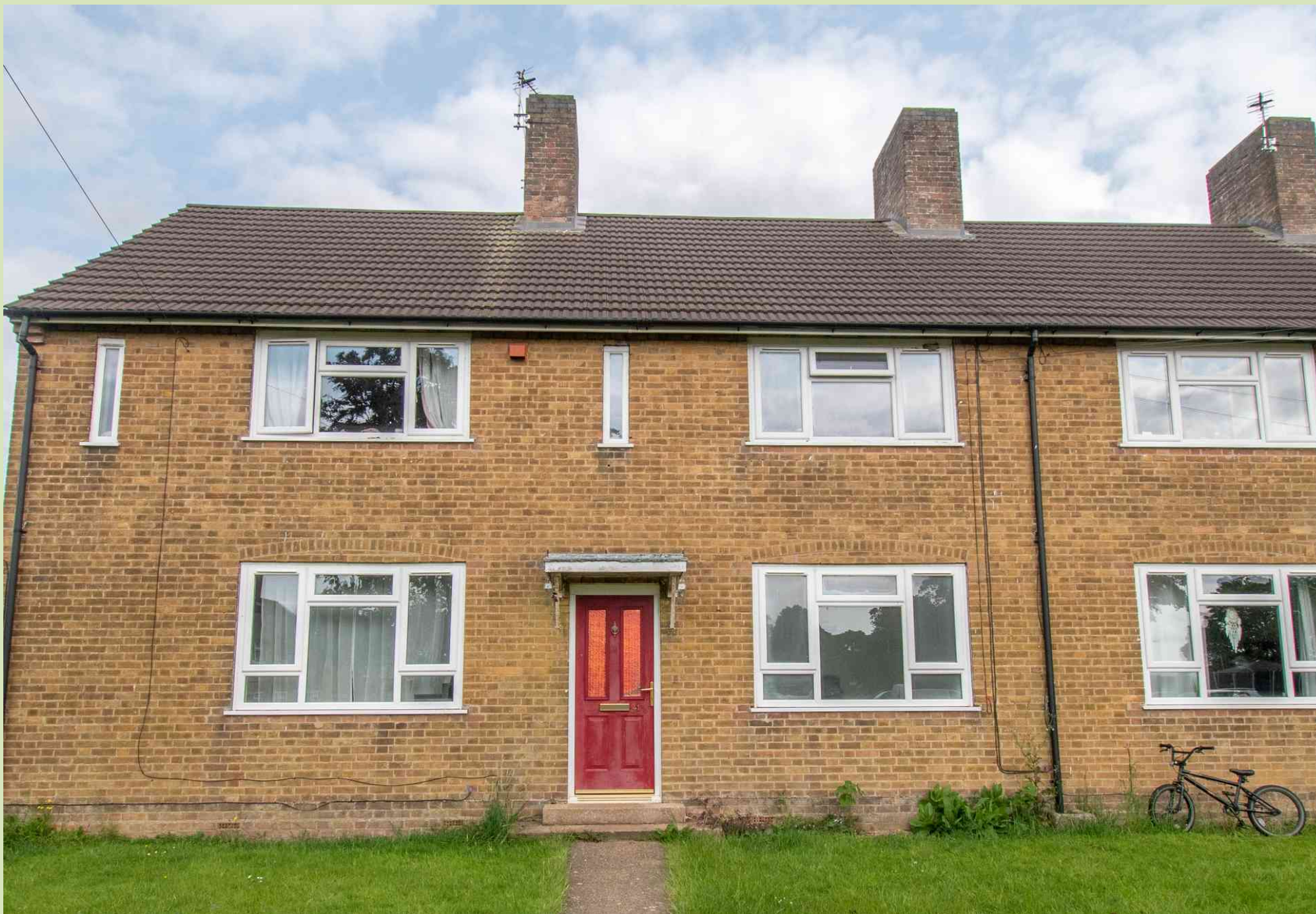
41 Oxburgh Square, West Raynham Guide Price £120,000