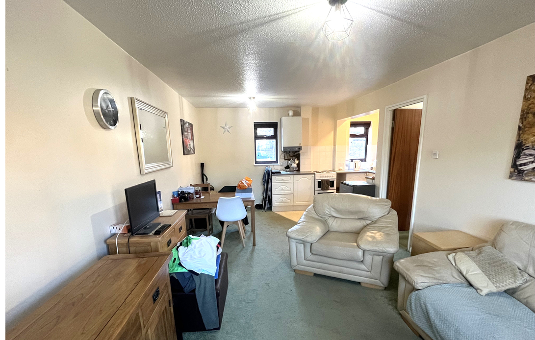
Dunstan Court, Leacroft, Staines-upon-Thames, Surrey TW18 4NX £169,950 - Leasehold