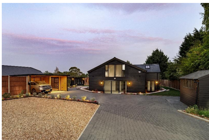
Field View, The Old Hay Barns Shrubbery Lane, Wilden, Bedfordshire MK44 2PH