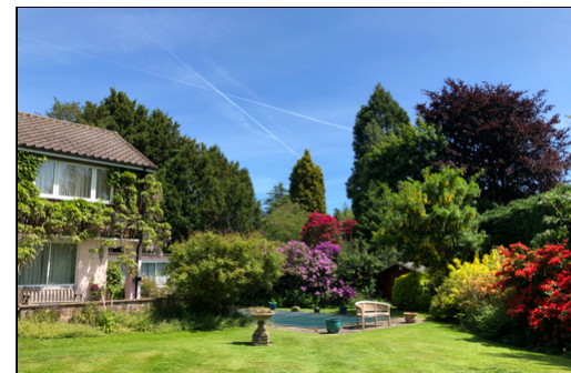
FOXBURY, THE OLD CARRIAGEWAY, CHIPSTEAD, SEVENOAKS, KENT TN13 2RL

Nestled within a glorious position in around a \frac{1}{2} acre plot with delightful approach at the end of a private road and set in impressive grounds, is this 1960's 4 bedroomed detached home that is on the market for the first time in more than 50 years. The property has been a much enjoyed family home and it is now time for a new family to reap the benefits and create their own memories and update to their own taste and design.