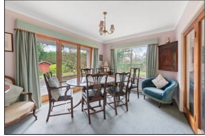
12'8" x 9'8" (3.86m x 2.95m) Attractive glazed solid wood framed folding doors to garden, double glazed window to rear.