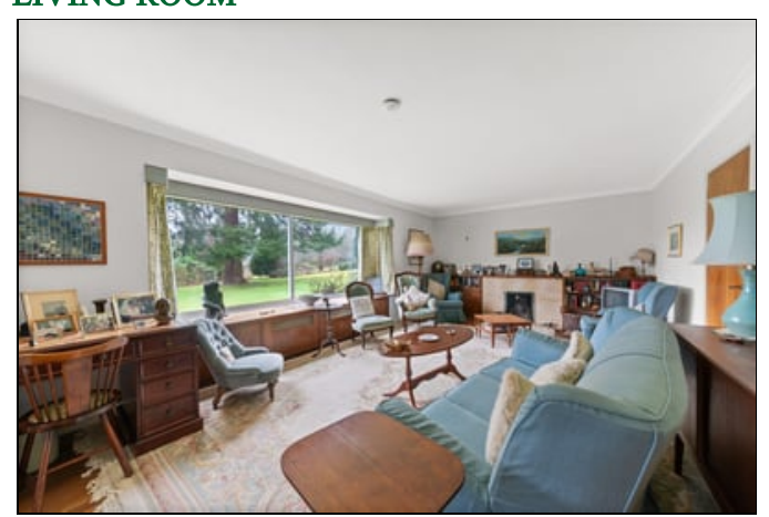
14'9" x 21'3" (4.50m x 6.48m) Large double glazed square bay window to rear, open fireplace, attractive solid wood folding doors to dining room, wood floor.