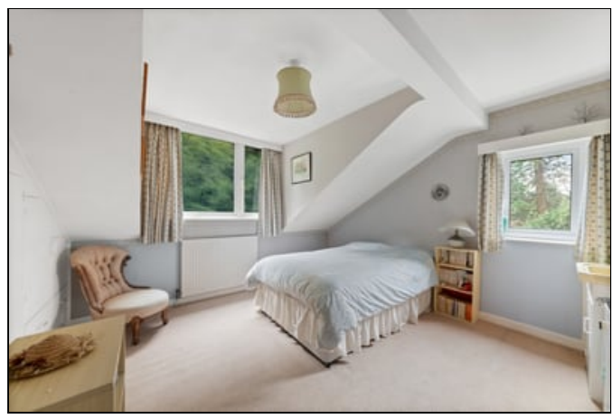
13'9" x 11'8" (4.19m x 3.56m) Dual aspect double glazed windows to side and rear, radiator, fitted wardrobes, vanity unit.