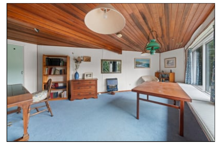
Electric heater, double glazed window with lovely view of garden and pool.