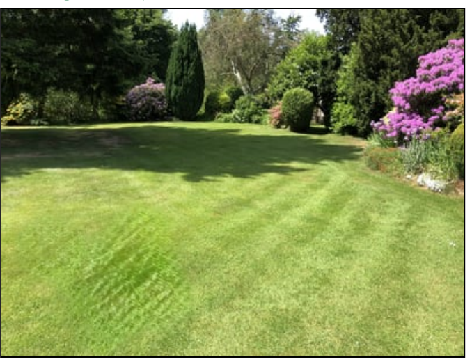
Approaching 1/2 acre with well established and most colourful shrubs, beautiful Wisteria, a complete delight to enjoy in summer. 30ft long swimming pool, pool house with gas heater and pump. (Requires overhaul as not used for sometime).

COUNCIL TAX BAND BAND G £3930.28 FOR 2025/2026