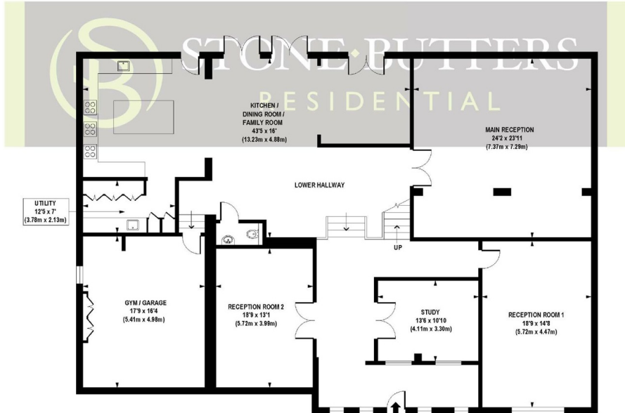
GROUND FLOOR GROSS INTERNAL FLOOR AREA 3141 SQ FT

APPROX. GROSS INTERNAL FLOOR AREA 5968 sq. ft / 554.45 sq. m