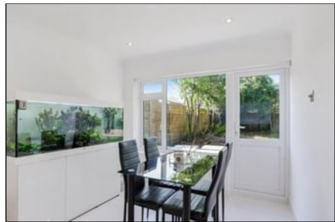
23' 5" x 11' 6" (7.14m x 3.51m) double glazed window to front, double glazed patio doors to garden, ceramic white tiled floor with underfloor heating.