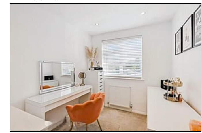
9' 1" x 7' 5" (2.77m x 2.24m) Double glazed window to front, radiator.