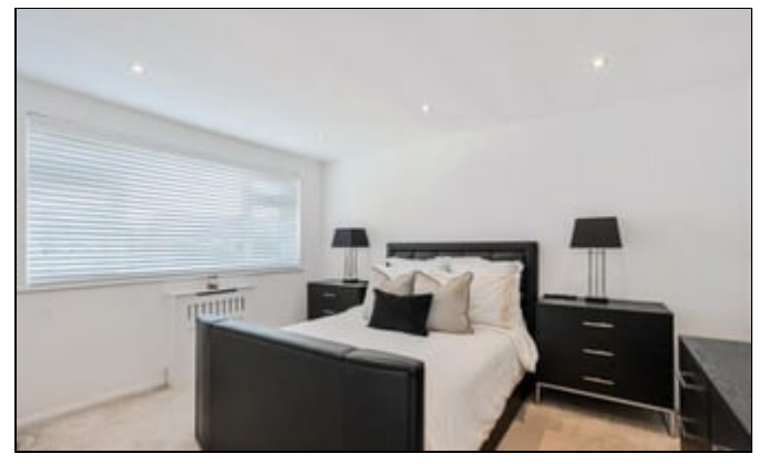
13'\ 2''\ x\ 10'\ 6''\ (4.01\ m\ x\ 3.20\ m) Double glazed window to the front, radiator.