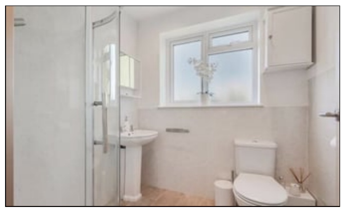
6' 5" x 5' 6" (1.96m x 1.68m) Corner shower cubicle, pedestal wash hand basin, low level W.C., opaque double glazed window to the rear, tubular heated towel rail, splash back tiling and panelling.