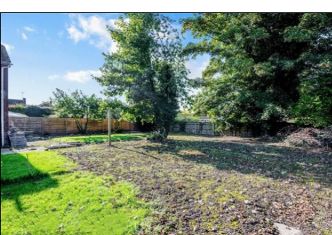
21 ORCHARD ROAD, OTFORD, SEVENOAKS, KENT TN14 5LG

AN INCREASINGLY RARE OPPORTUNITY! A 3 bed detached house that is move in ready but would lend itself to enlargement set within an excellent corner shaped garden plot with plenty of parking, located at the end of a quiet cul-de-sac in this highly favoured and sought after village close to Sevenoaks. The owners have modernised the interior stylishly but left any extensions or building plot potential for the next owner.