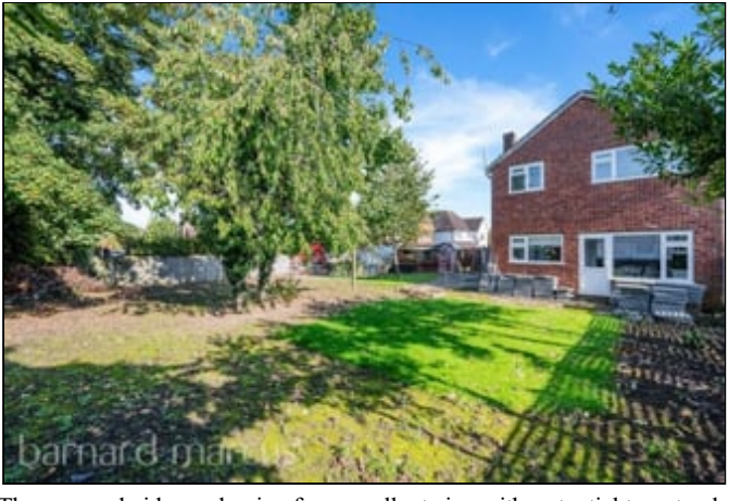
The rear and side garden is of an excellent size with potential to extend or build (stpp), outside tap.