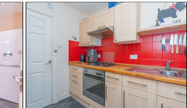
3.20m x 1.80m (10' 6" x 5' 11")