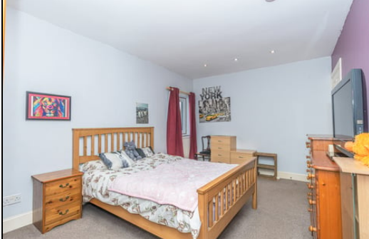
4.60m x 3.0m (15' 1" x 9' 10")