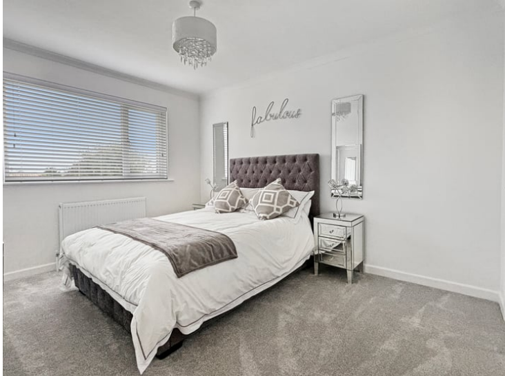
13' 0" x 12' 0" (3.96m x 3.66m) Double glazed window to rear, radiator, fitted wardrobes.