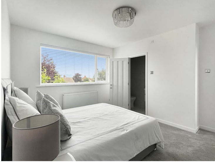
13' 10" x 10' 06" (4.22m x 3.20m) Double glazed window to rear, radiator, door to: