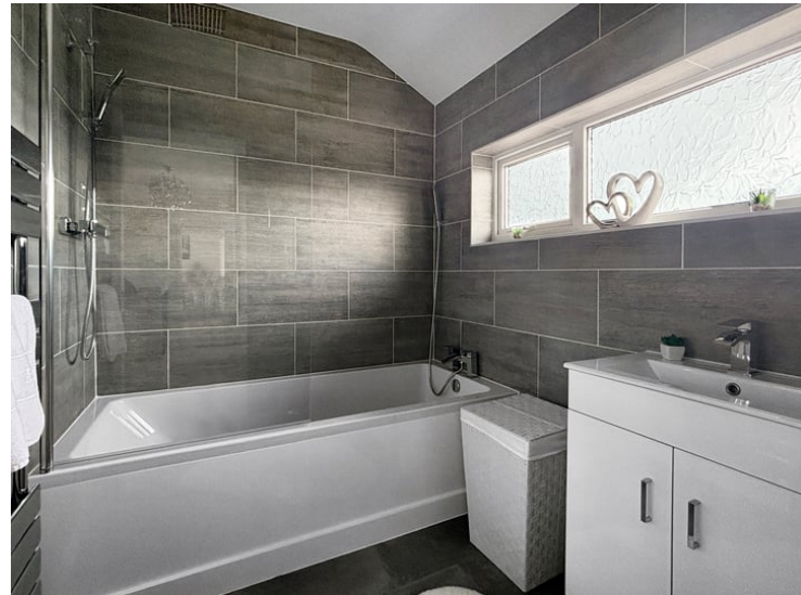
Double glazed window to front, tiled walls, towel rail, vanity unit, panelled bath, low level WC.