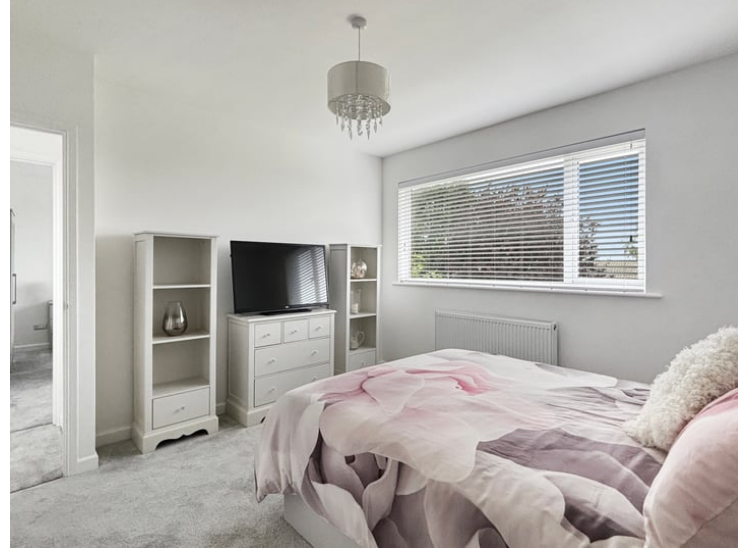
13' 1" x 12' 03" (3.99m x 3.73m) Double glazed window to rear, radiator.