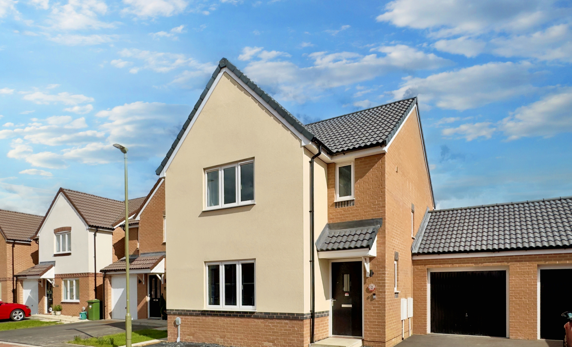
2 Meteor Row, Grove, Wantage, Oxfordshire OX12 0PG Oxfordshire, Offers Over £411,000