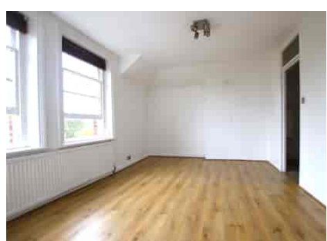
Beulah Hill, London, SE19 3EW