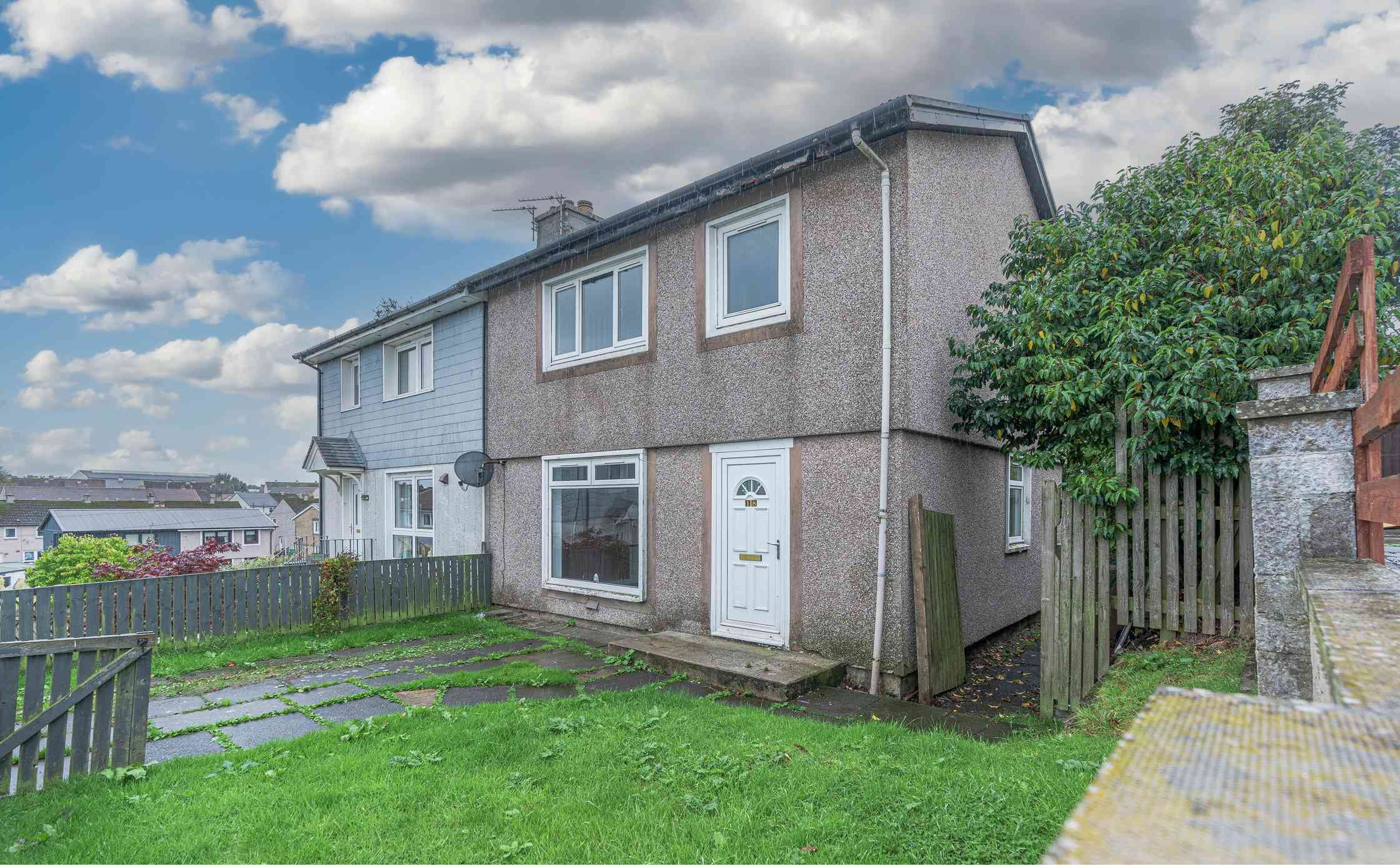
Offers Over £100,000 18 Braemount, Cowdenbeath, Fife, KY4 9RB