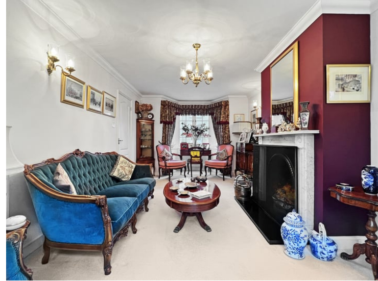
22' 1" x 10' 5" (6.73m x 3.17m)