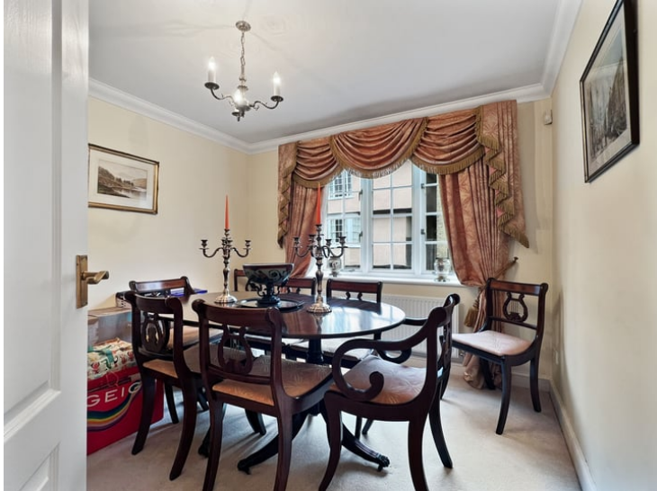
10' 5" x 10' 0" (3.17m x 3.05m)