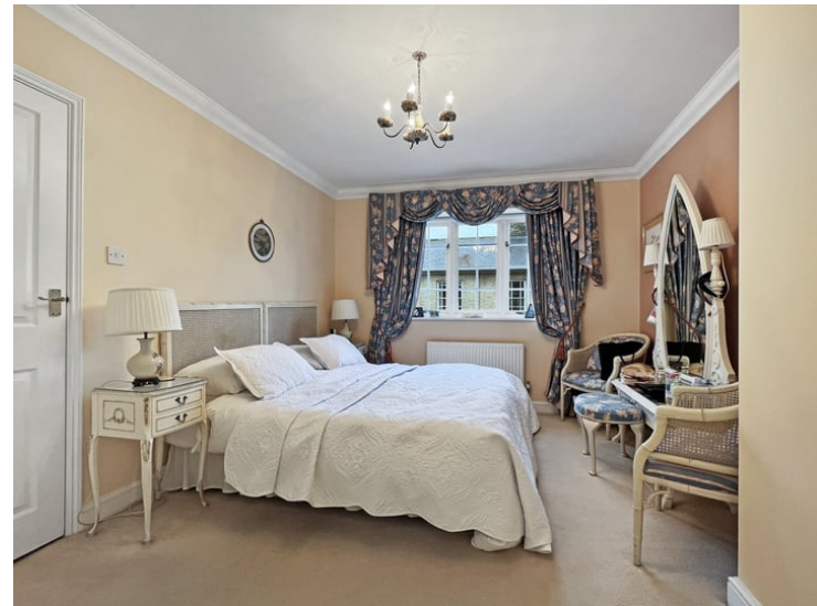
12' 9" x 10' 6" (3.89m x 3.20m)