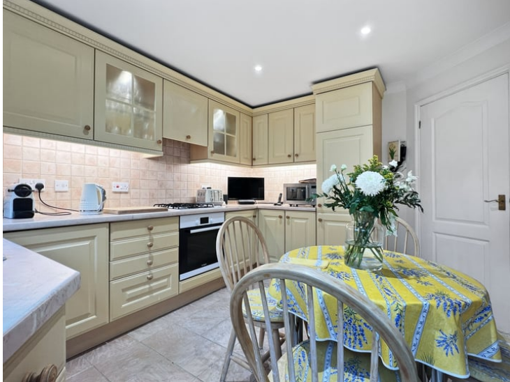
10' 8" x 10' 0" (3.25m x 3.05m)