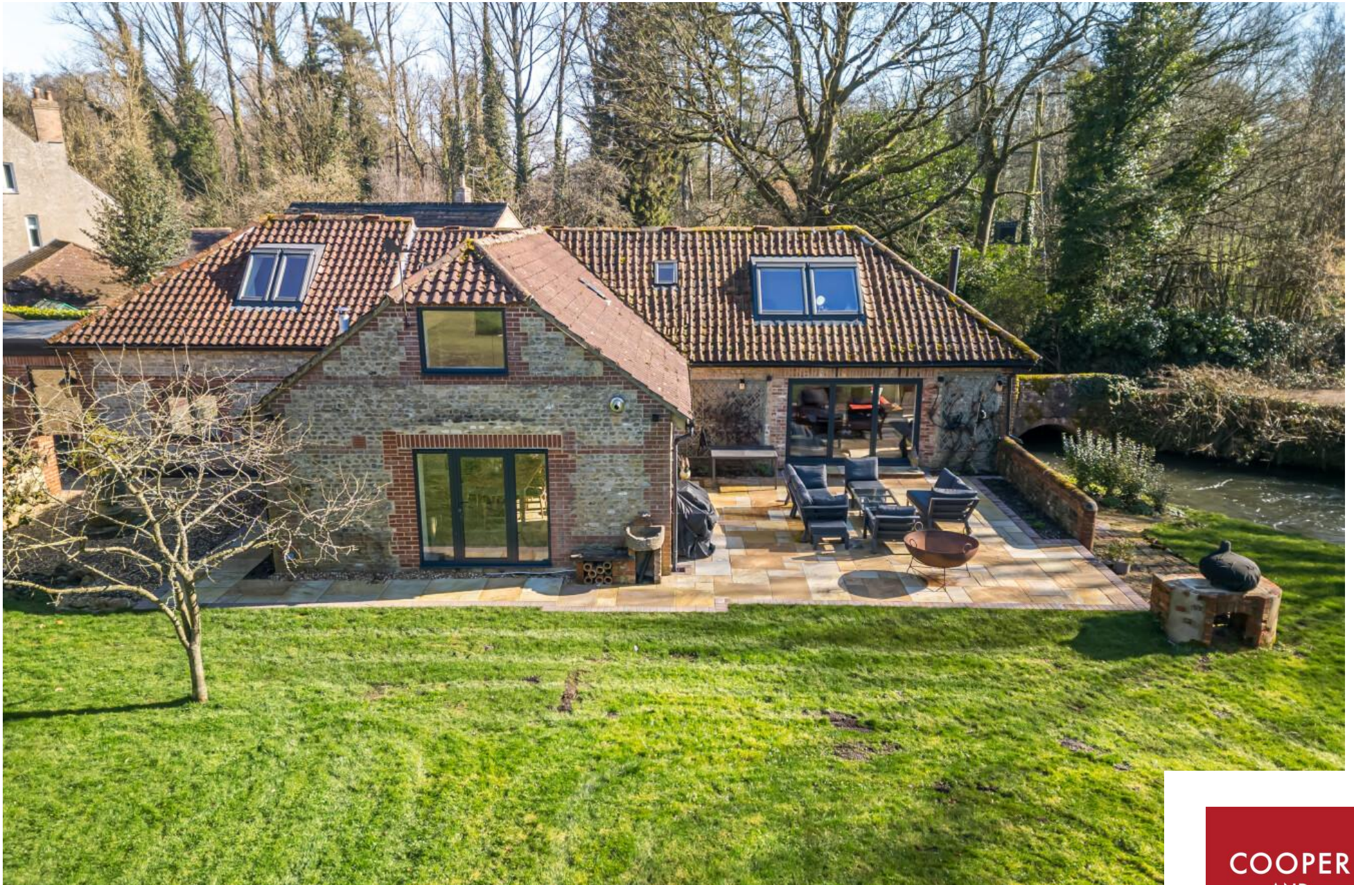
Old Mill Barn, Henford Marsh, Warminster, Wiltshire, BA12 9PA