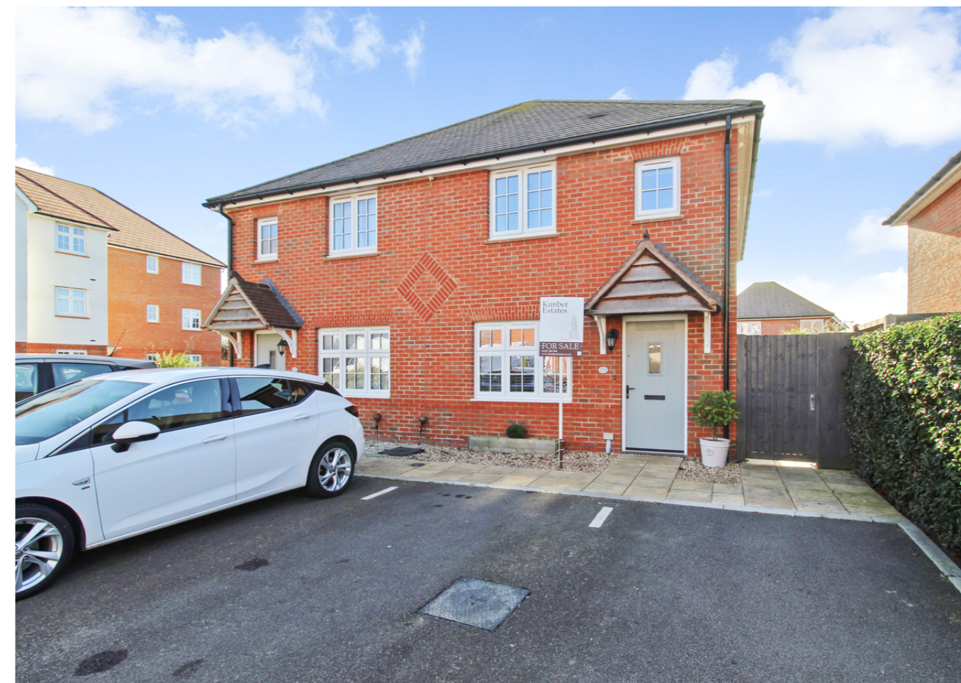
4 Heath Grove, Herne Bay, Kent, CT6 5FA