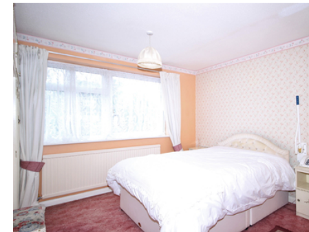
22 The Rowans, Baldock, Hertfordshire, SG7 6HL