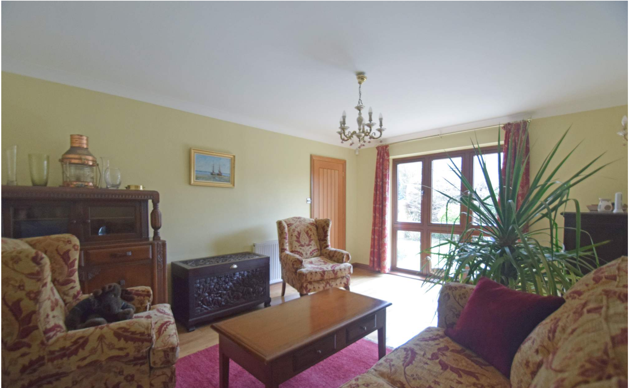
PLACE LANE, HARTLIP, SITTINGBOURNE, KENT, ME9 7TR