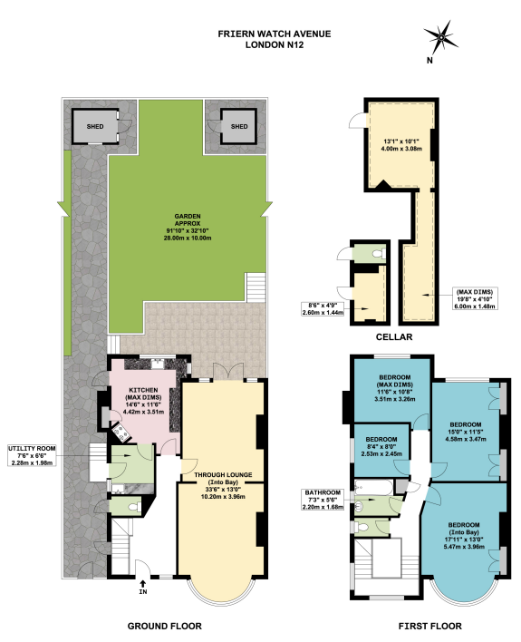
APPROX. GROSS INTERNAL FLOOR AREA 1541.50 SQ, FT /143.21 SQ, M MILIST EVENT ATTEMT MAS BEEN MAGE TO RESURE THE ACCUMACY OF THE FLOOR FAIL CONTAINED HERE. MINISTERMENT OF COODES WINDOWN FROOMS AND ANY OTHER TIESS ARE APPOCIATIONAL FAIL ON RESPONSIBILITY 15 TAKEN FOR ANY ERROR, OMISSION, OM MISSTATEMENT. THIS FLAN IS FOR ILLUSTRATIVE PURPOSES ONLY AND SHOULD BE USED AS SUCH, BY ANY PROSPECTIVE PURPOKASER.