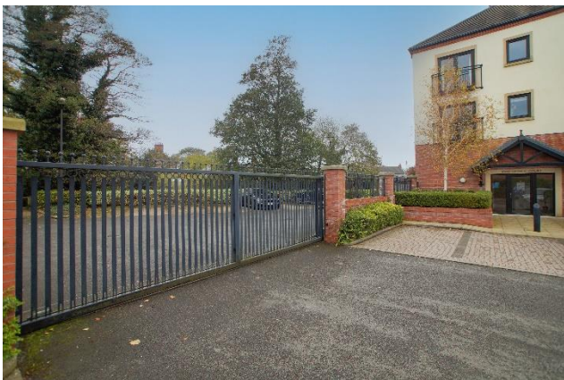
GATED ALLOCATED PARKING

OUTSIDE Communal gardens and secure gated allocated parking.