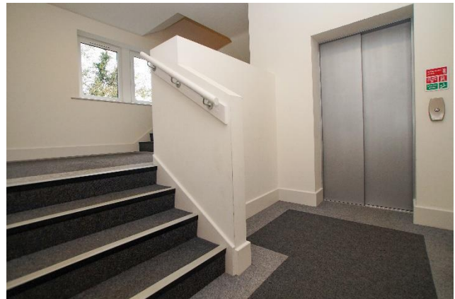
COMMUNAL ENTRANCE HALL