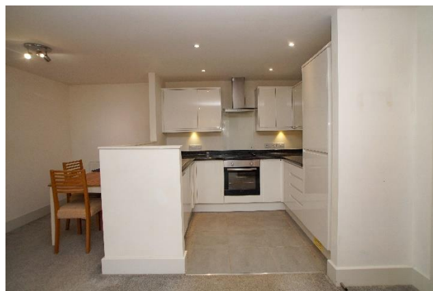
OPEN PLAN DINING LOUNGE/KITCHEN