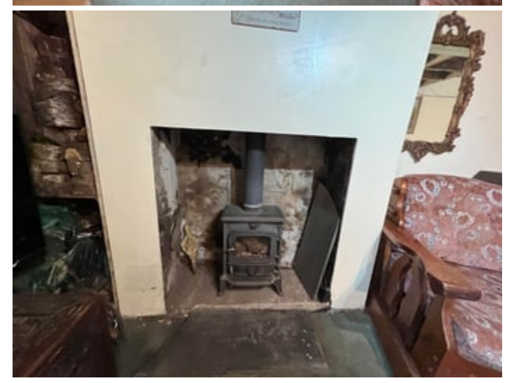
15' 11" x 13' 0" (4.85m x 3.96m) with an open fireplace housing a multifuel burning stove on a stone heatrth, stairs to first floor, double glazed window to front, electric heater.