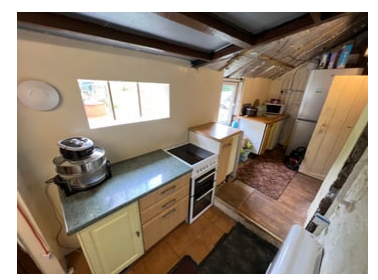
22' 6" x 5' 8" (6.86m x 1.73m) Being split level and comprising of a range of base cupboard units with formica working surfaces above, FLAVEL electric double oven with 4 ring hob above, electric heater, 3 windows overlooking rear garden, hardwood exterior door, extarctor fans.