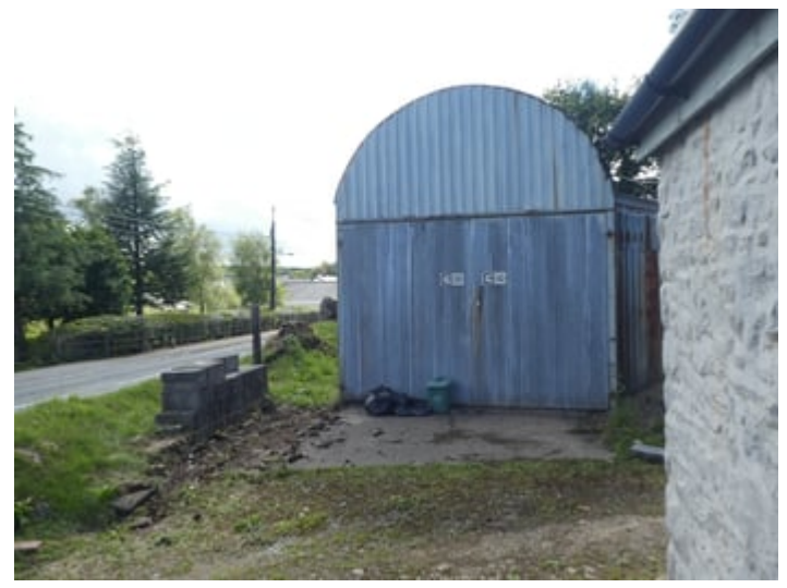
12' 5" x 21' 7" (3.78m x 6.58m) with inspection pit. Lean to Shed.