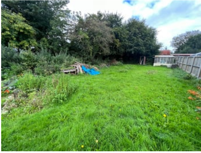
Spacious grounds at rear mostly laid down to grassed areas. Potting shed, woodstore and other useful outbuildings.