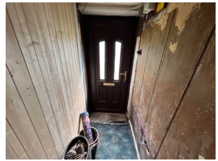
3' 0" x 7' 8" (0.91m x 2.34m) With hardwood effect uPVC double glazed entrance door. Exposed beams.