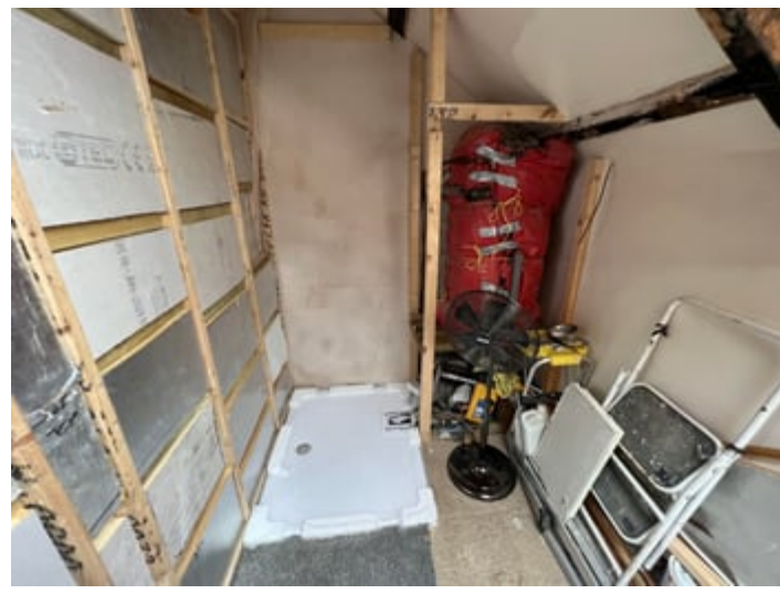
6' 0" x 9' 4" (1.83m x 2.84m) The suite has yet to be installed, however has plumbing for a shower, W.C and sink unit. Cupboard housing the hot water tank.