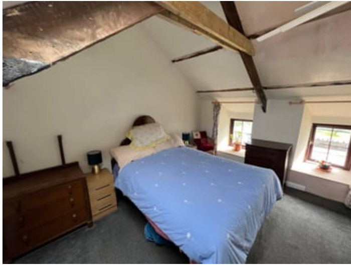
10' 0" x 12' 5" (3.05m x 3.78m) with 2 double glazed windows to front, velux window to cieling, exposed 'A' frame beam, electric heater.