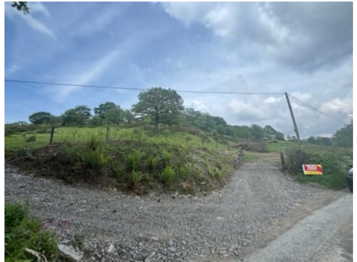
LAND (FIRST IMAGE)