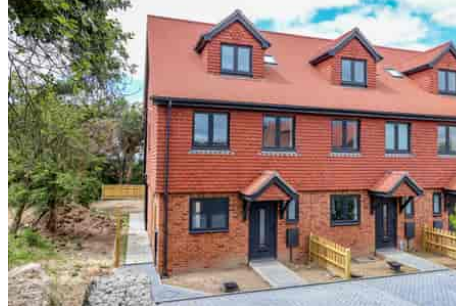
Plot 4, Bradshaw Close, Guestling, East Sussex TN35 4LW